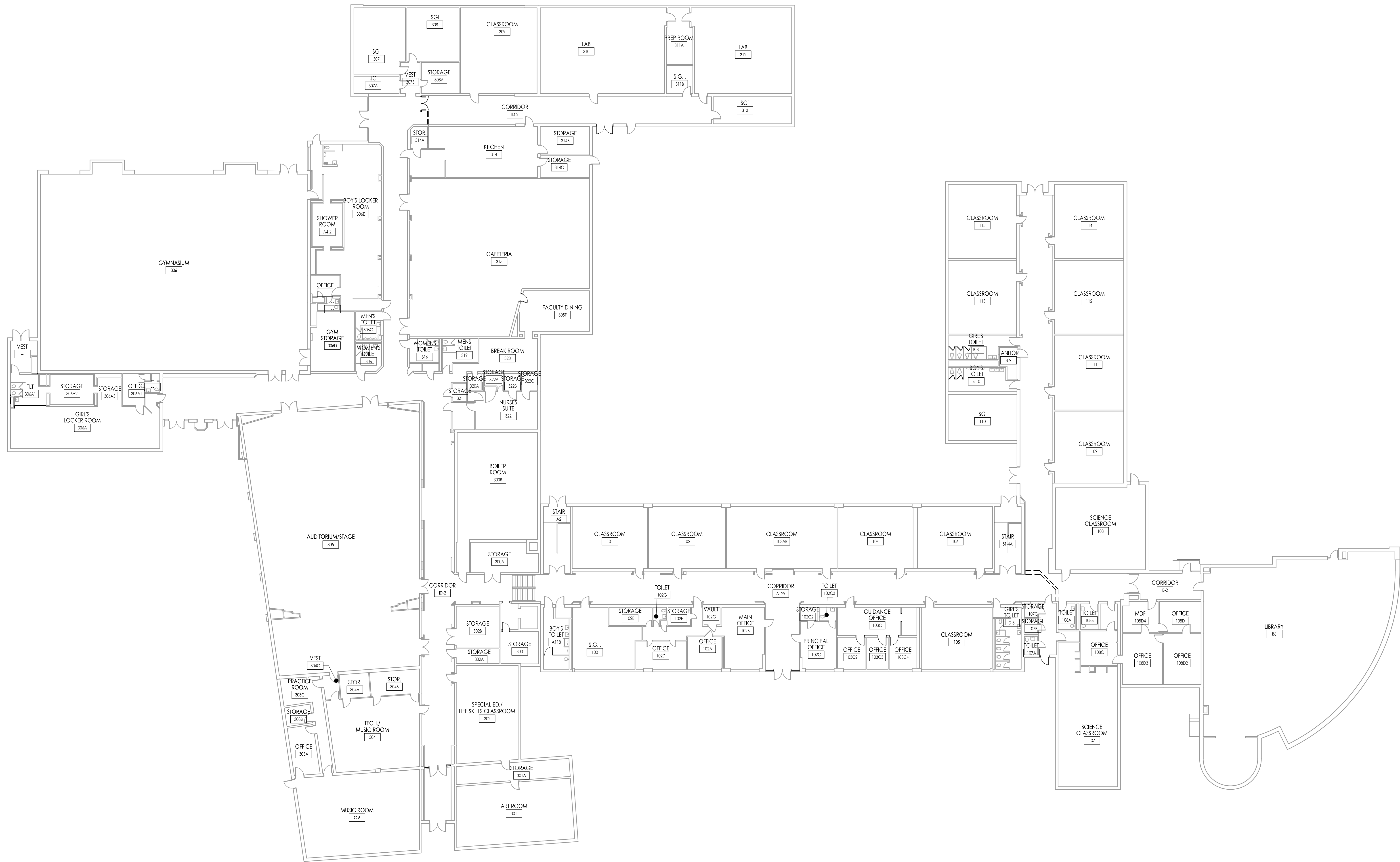
EXISTING OVERALL FIRST FLOOR PLAN LAWRENCE MIDDLE SCHOOL Scale: 1/16"=1'-0"