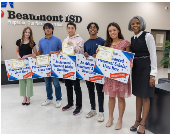
BISD students receive recognition from College Board as AP Scholars!