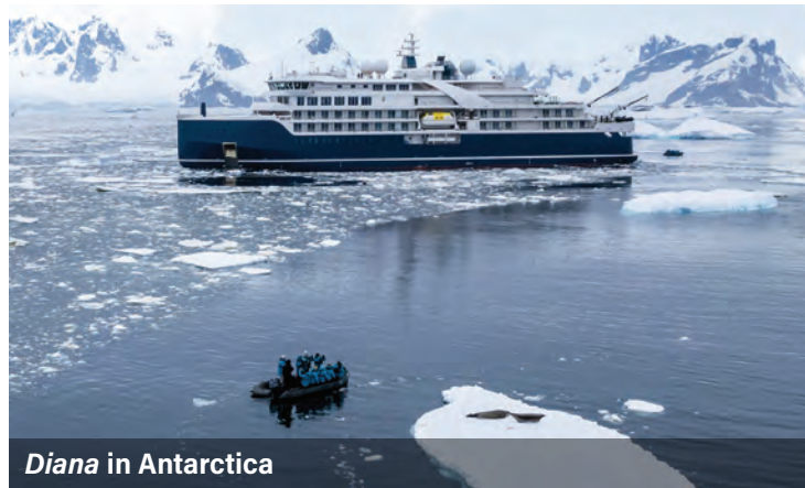
Diana in Antarctica