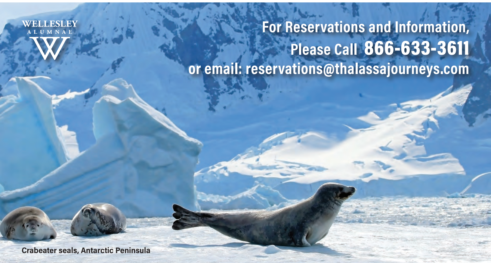
Crabeater seals, Antarctic Peninsula

For Reservations and Information, Please Call 866-633-3611 or email: reservations@thalassajourneys.com