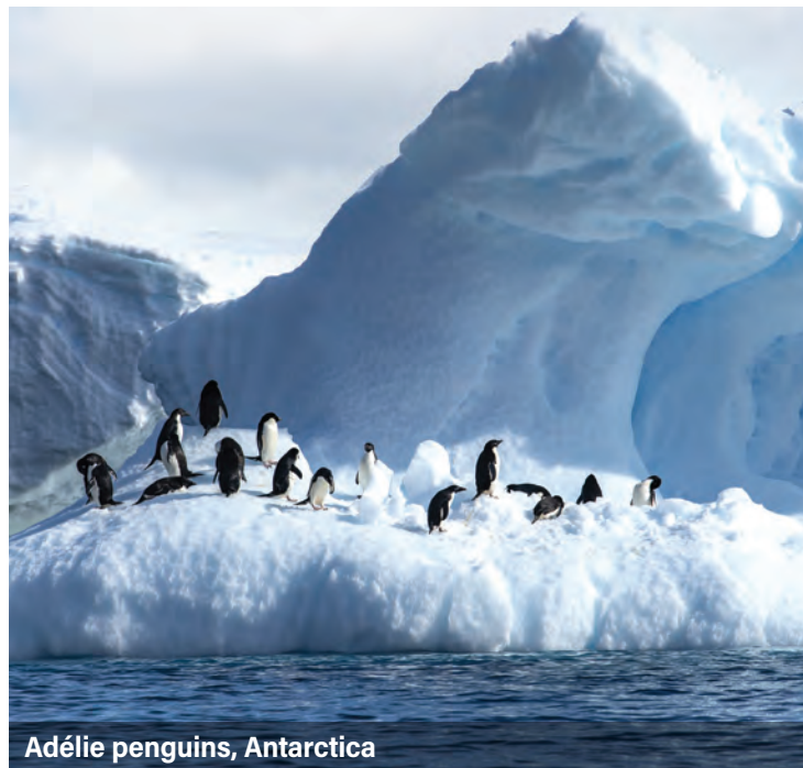
Adélie penguins, Antarctica