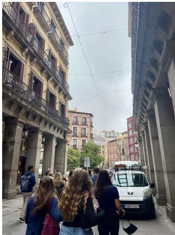
A street in the heart of Madrid.

most famous art museums in all of Spain. Home to many Goya and Velasquez paintings, the museum was gorgeous and unique. Then, we took a break where we were able to go to lunch at a place of our choosing. We chose a restaurant like Chipotle that was quite good. Then, we reunited with our big group and went on a walking tour of the city. The tour was educational, and then we were then given a few hours to explore the city ourselves which was so much fun. We stumbled upon a pretty coffee shop and cute boutiques. Once again, we took the train home. Overall Madrid was quite fun and I liked how much freedom we had to explore. Additionally, even as someone who isn't the most artistic, I appreciated our trip to the museum. I would return and recommend Madrid, that's why I would rate it a 9.5/10.