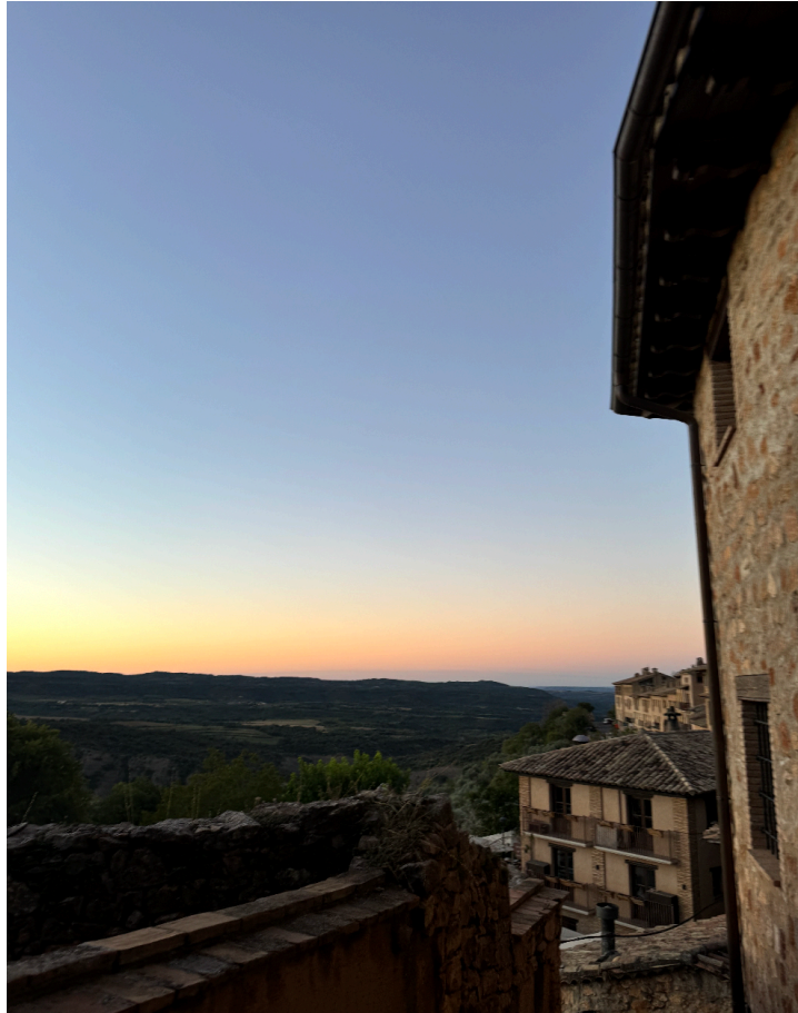
A sunset from the top of the city in Alquezar.

The first place my school took us to was overnight in the small northern town of Alquezar. Alquezar is a beautiful, ancient, and historical city northeast of my city of residence, Zaragoza. We traveled two hours by bus and arrived around lunchtime. The hotel served a two-course lunch that consisted of tomato pasta and lamb. Later, we traveled in smaller groups to visit the city's crown jewel: La Iglesia Parroquial de San Miguel . The church was informational and alluring, with ancient architecture that has stood there for centuries. We were then given the chance to explore independently and my friends and I managed to find the only ice cream store in town. I can confidently say the Avellana gelato was the best gelato that I have ever had in my life. Later, we ate dinner at the hotel, another two-course meal of shrimp and vegetables. The next day, we went on a hike to explore the town's natural elements and ended at a viewpoint where we could see the mountains. Overall, Alquezar was beautiful. I would rate Alquezarit a 7.5/10.