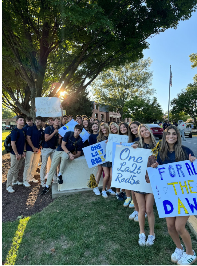
Seniors welcoming the Bulldogs on the first day of school.