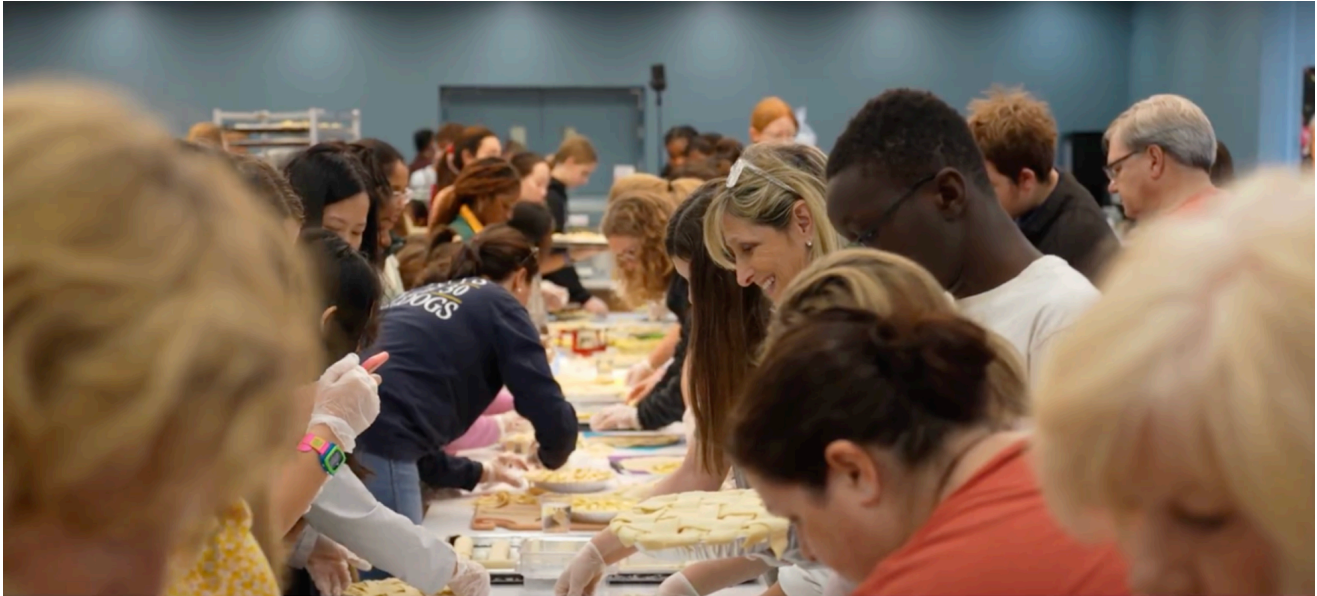
Bullis pie bake of 2023.