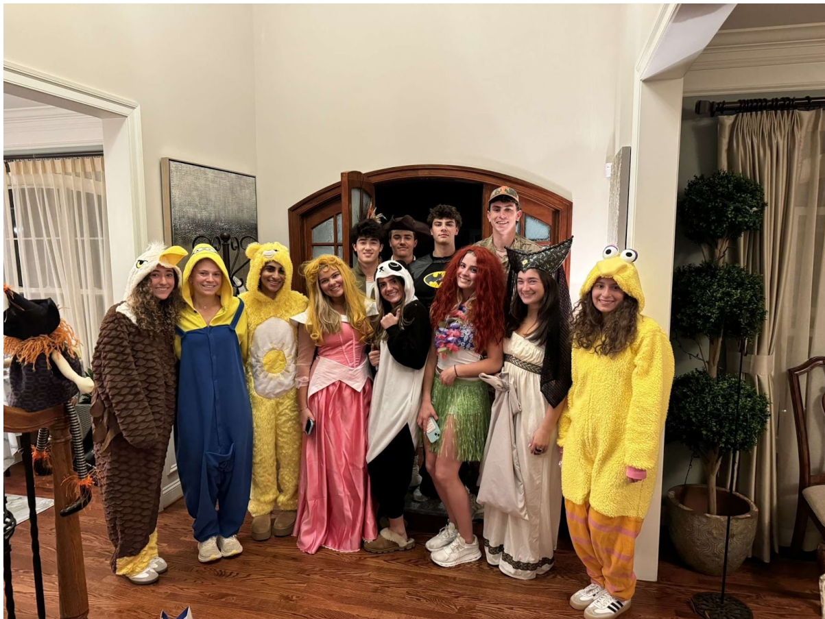
Seniors dressing up together on Halloween.

Hello Bullis! As Thanksgiving approaches, many seniors in high school are taking a moment to reflect on what they are grateful for during this final stretch of their high school journey. Surrounded by friends, family, and teachers who have supported them, seniors often feel thankful for the memories they've built and the opportunities that lie ahead. With college applications underway and a busy season of planning for the future, it's easy to overlook the present—but this time of year reminds them to cherish the friendships, experiences, and growth they've experienced along the way. This Thanksgiving, seniors are embracing the festive cheer, showing appreciation for their school community, and looking forward to a bright future with a spirit of gratitude.