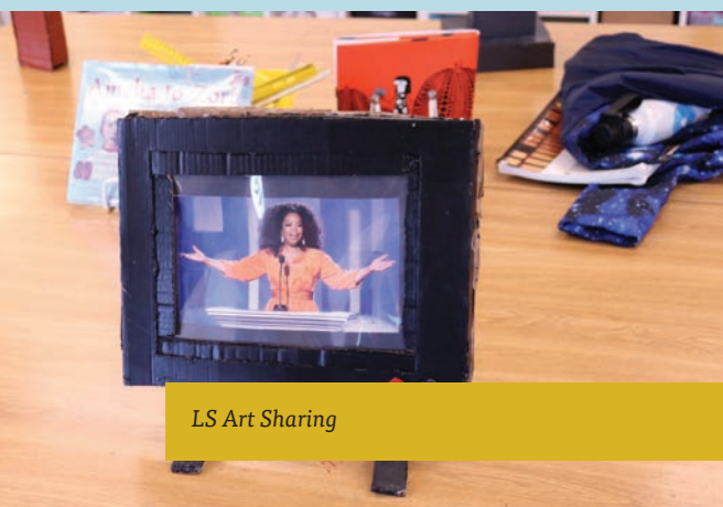
LS Art Sharing