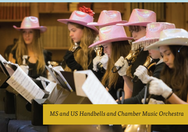
MS and US Handbells and Chamber Music Orchestra