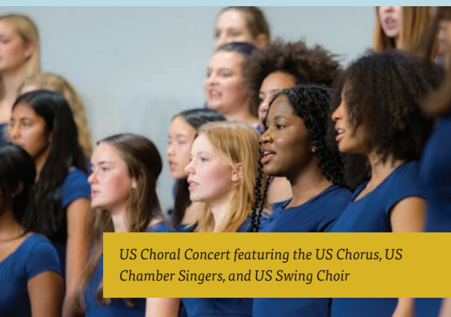
US Choral Concert featuring the US Chorus, US Chamber Singers, and US Swing Choir