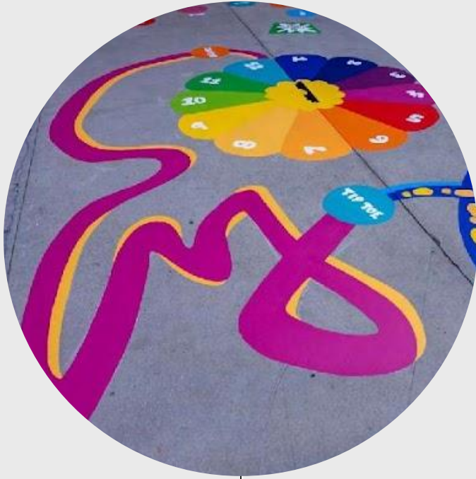
SENSORY PATH & GAME MARKINGS