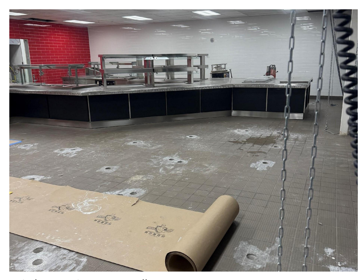
Kitchen Equipment Install