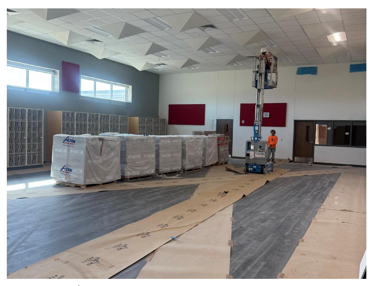
Music Band Room