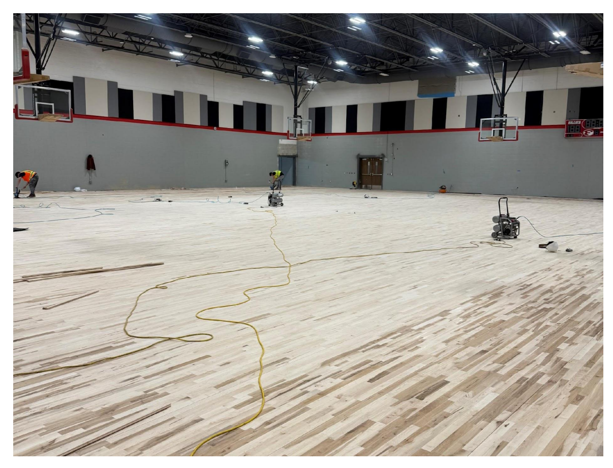
Gym Floor Install