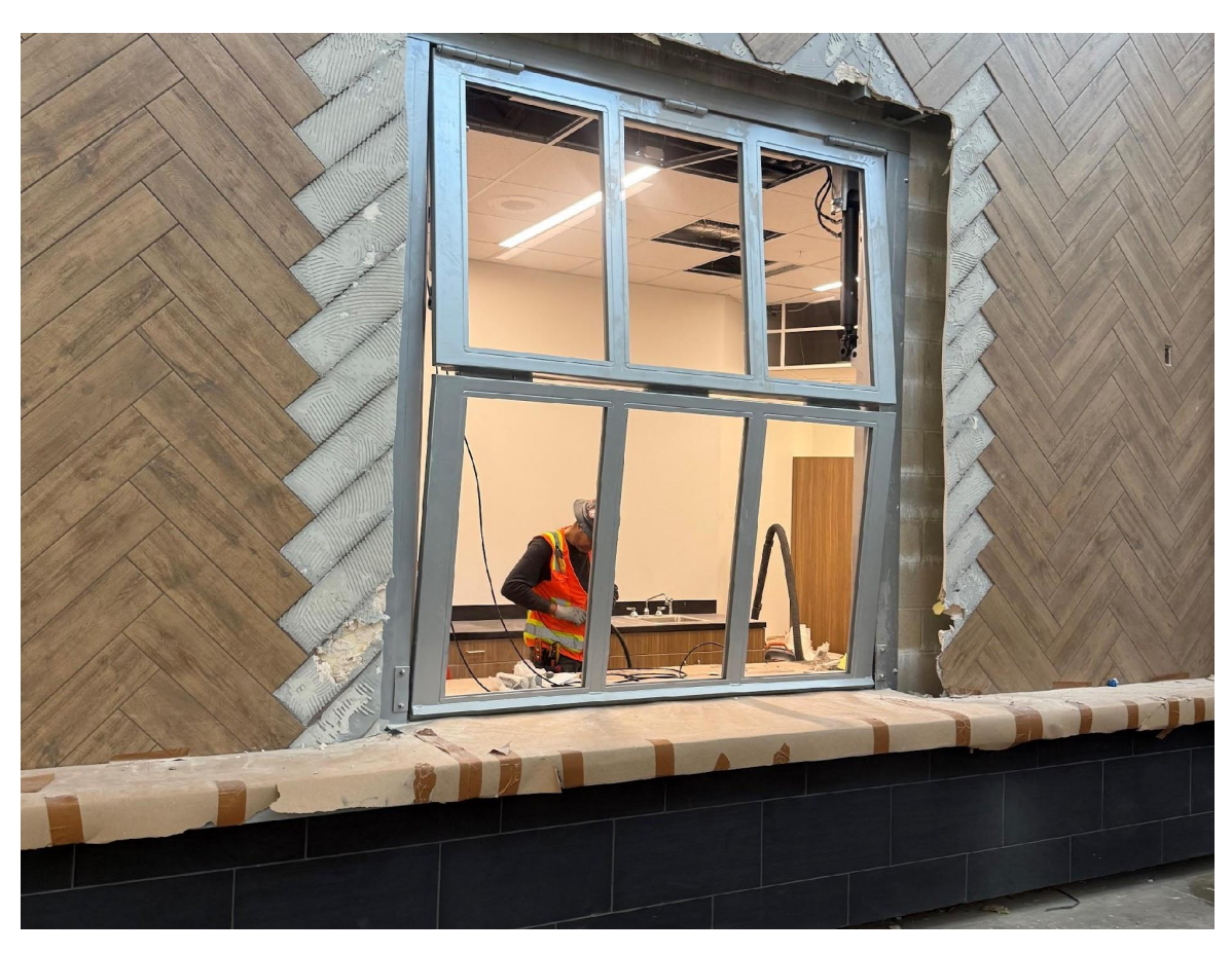
Trading Post Wall