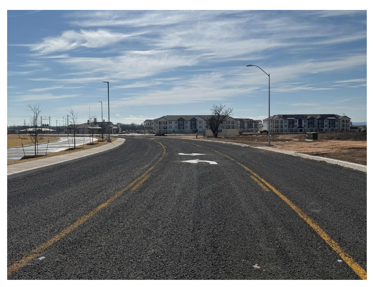
Post Oak Stripping