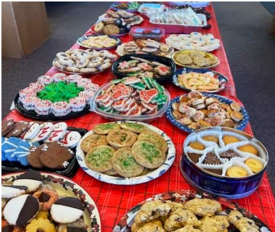
FPO Staff Holiday Breakfast