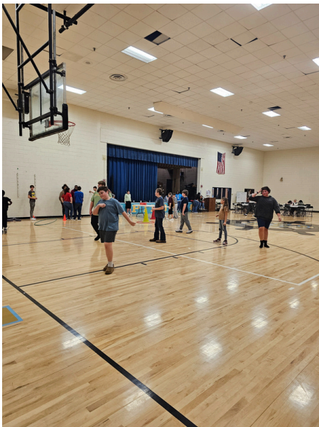
iReady growth celebration.