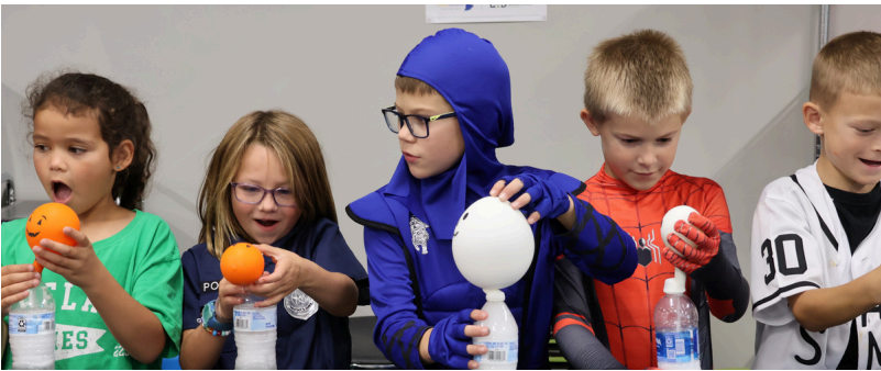
Above: 2nd grade students completed a Halloween STEM activity where they inflated balloons with baking soda and vinegar.