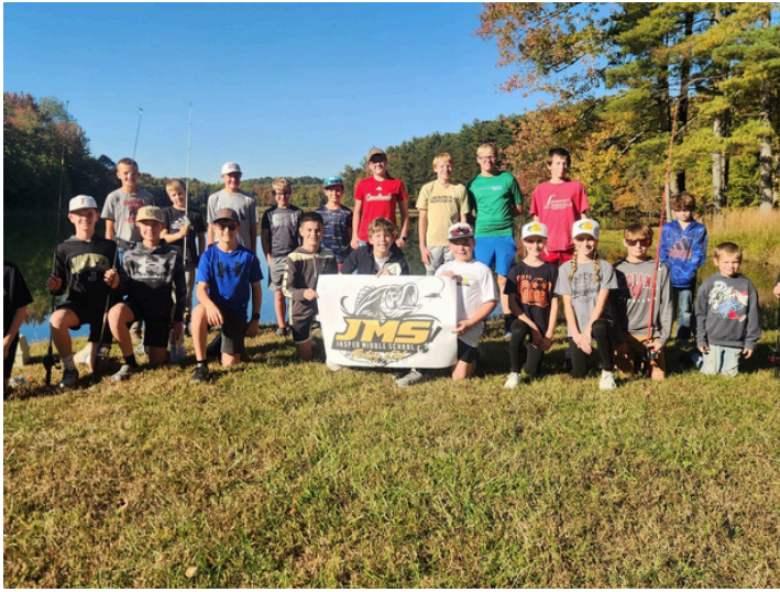
Above: The JMS Fishing Club has hosted many fun events for members and their families!