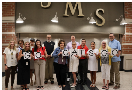
Left: JMS Staff gets ready for the first day of school.