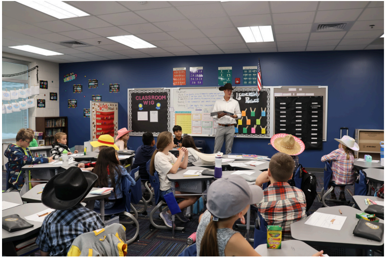
Above: JES celebrated literacy growth by having a Western Day with lots of guest readers.