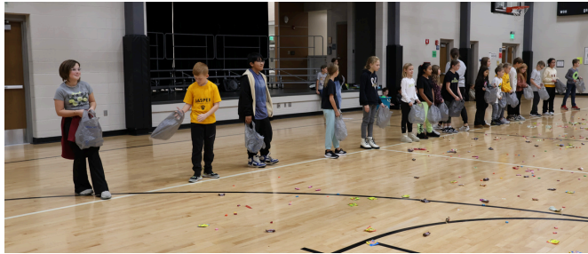
Left: JES raised over $5,000 for Riley Children's Hospital during Riley Week through dress up days and activities.