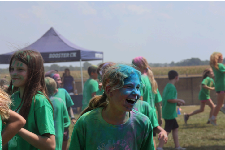
Above: After raising money for Ireland Elementary School, the 5th grade students got to enjoy the color run.