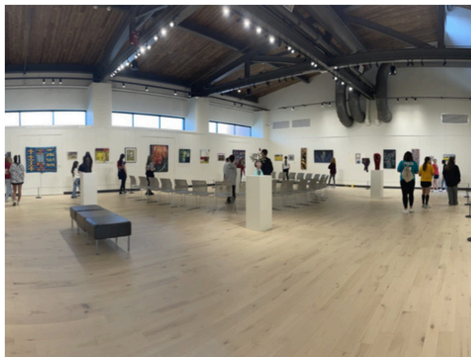
Left: The JMS Student Art Club went on a field trip to the Thyen-Clark Cultural Center.