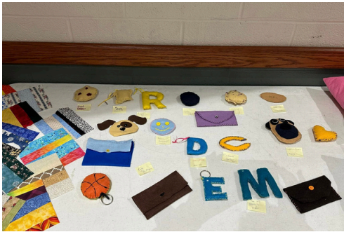
Left: Student work was put on display at the Creative Arts Showcase.