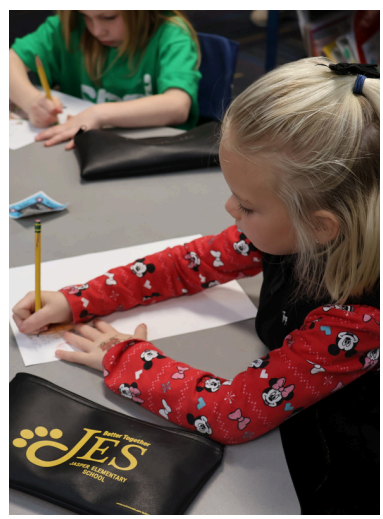
Left: Kindergarten students had a blast participating in many Thanksgiving themed activities before break.