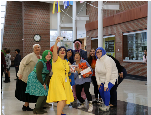
Above: JHS Staff participate in the Halloween Parade.