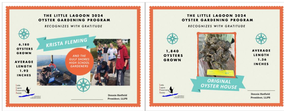
Gulf Shores High School & Original Oyster House Certificates