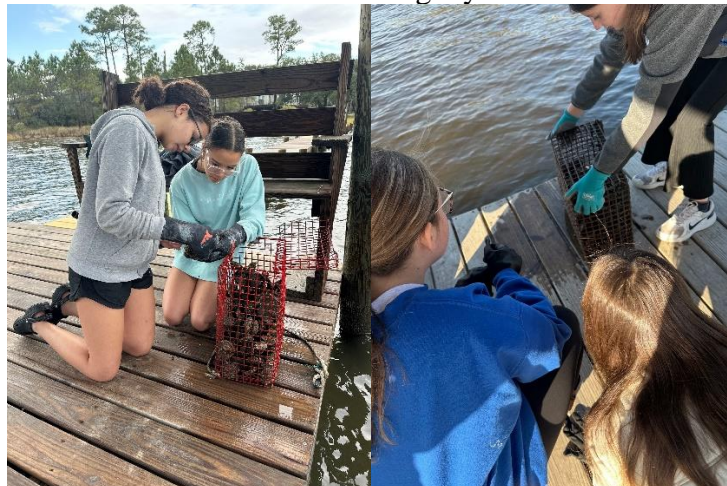
G.E.M.S students tending Oyster Gardens