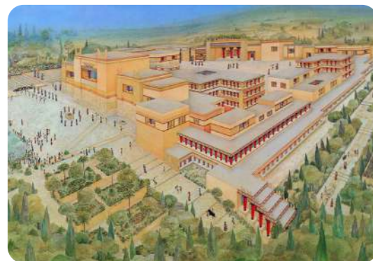
Reconstruction of the palace of Knossos

The Minoan civilisation existed between c3000 BC and c1100 BC on the Greek island of Crete. At the civilisation's peak, around 10,000 people lived in 90 cities. As Europe's first developed civilisation, the Minoans lived in towns with roads, wells and a basic sewerage system. They were capable farmers and skilled craftspeople. Their architects oversaw the building of palaces. They were also skilled in making pottery. They traded goods, such as olive oil, pottery and cloth. The Minoans also used an early writing system known as Linear A.