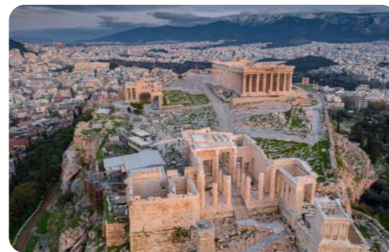
Aerial view of the Acropolis

The Classical period started in c500 BC and ended in 323 BC. It is known as the golden age of ancient Greece because many discoveries and advancements were made. People in the Classical period believed in gods and mythology from earlier periods, although philosophers and scientists at the time began to challenge those beliefs. Their architecture featured symmetrical designs and columns. Like the Minoans and Mycenaean before them, people in Classical Greece established trade links both within Greece and with surrounding countries.