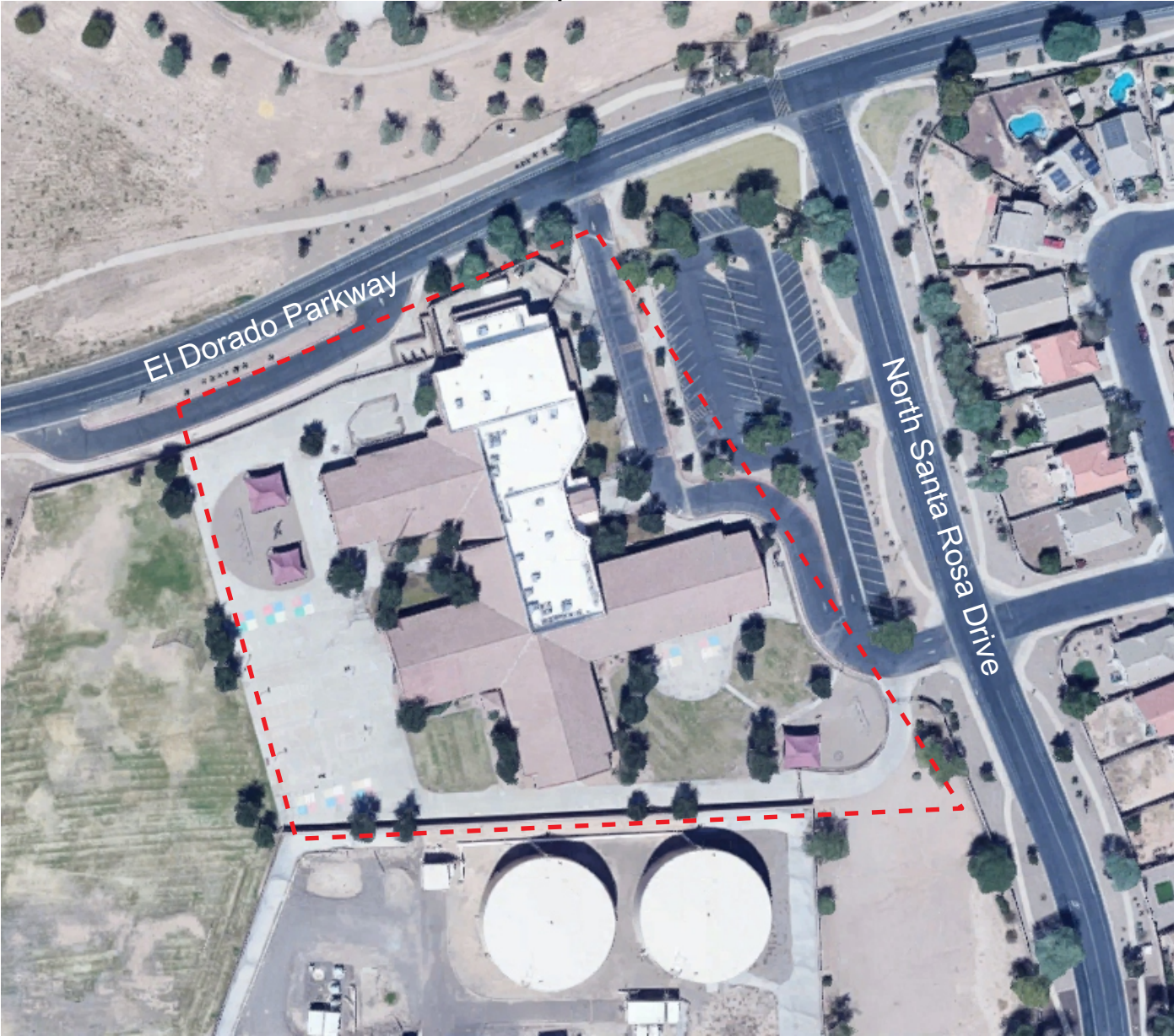
DIAGRAM NOT TO SCALE

Santa Rosa Elementary School 21400 North Santa Rosa Drive Maricopa, Arizona