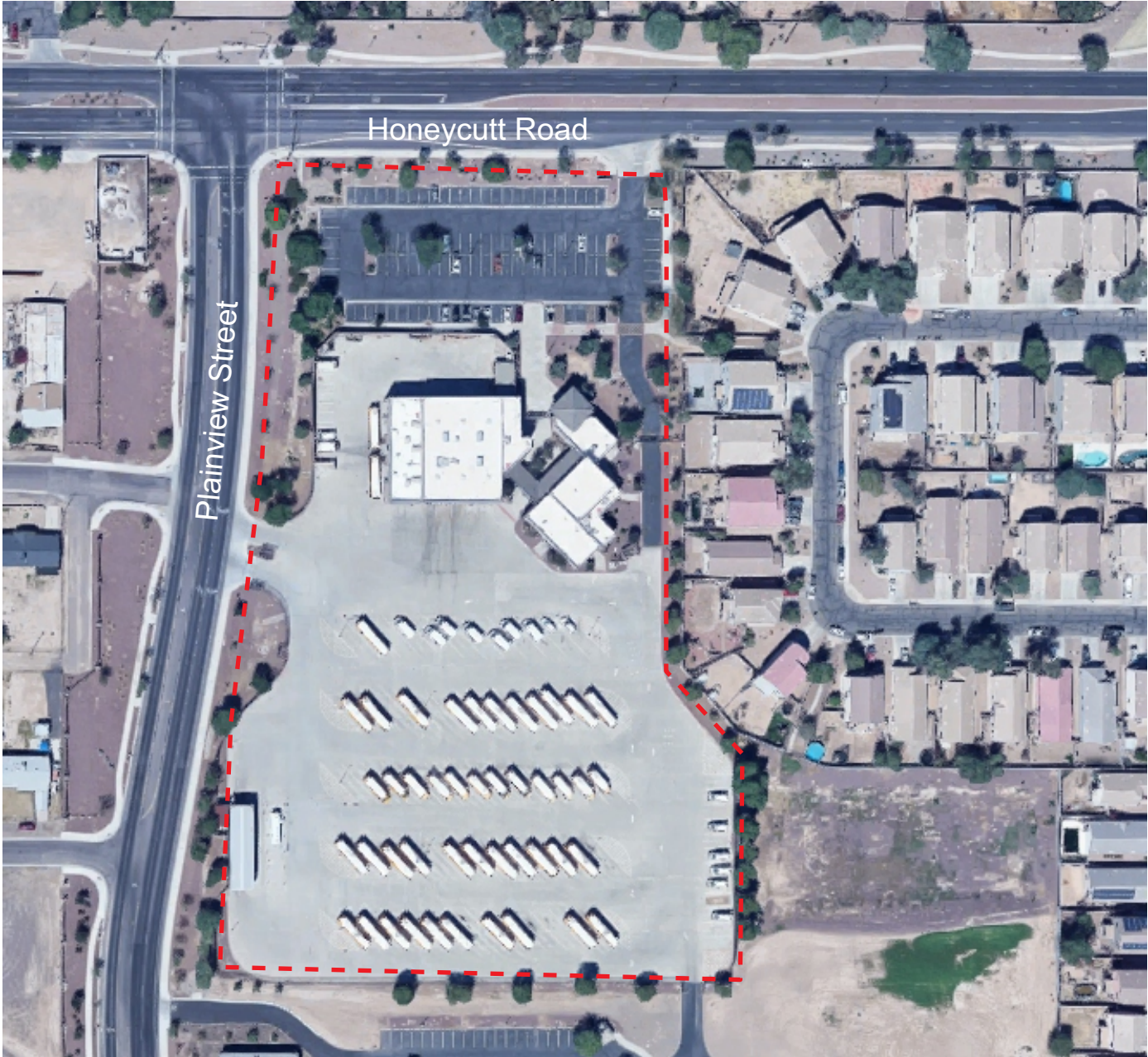
DIAGRAM NOT TO SCALE

Transportation – Bus Barn 44205 West Honeycutt Road Maricopa, Arizona