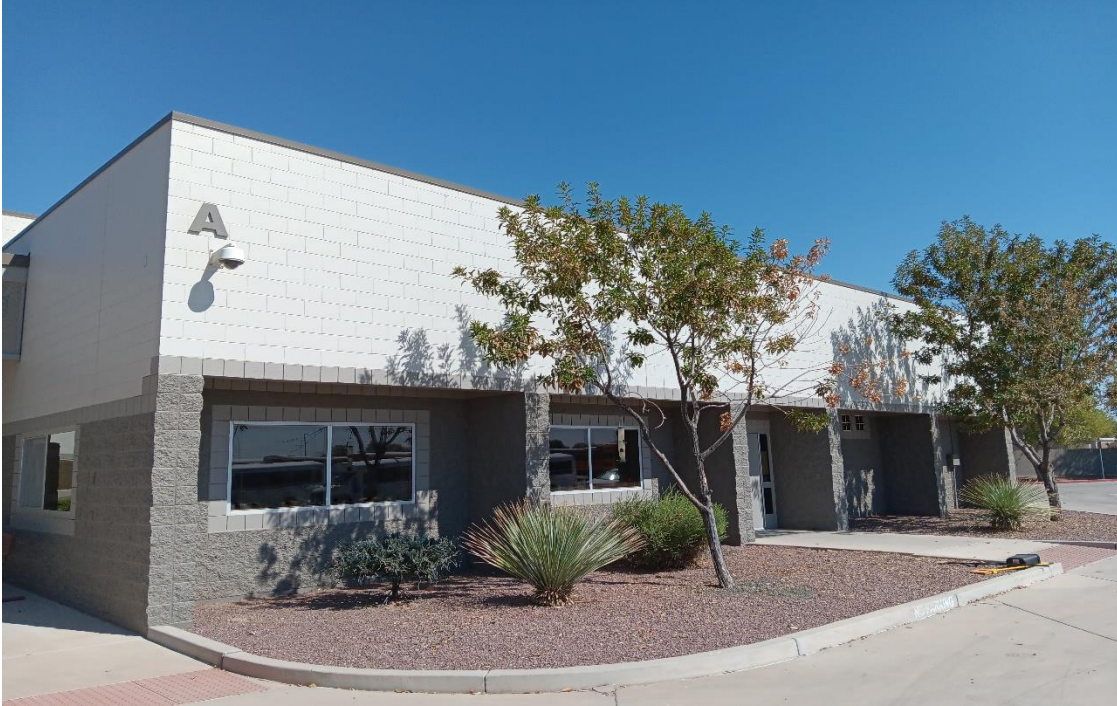
Picture 1 – The Maricopa Unified School District #20 Transportation Building office main entrance.