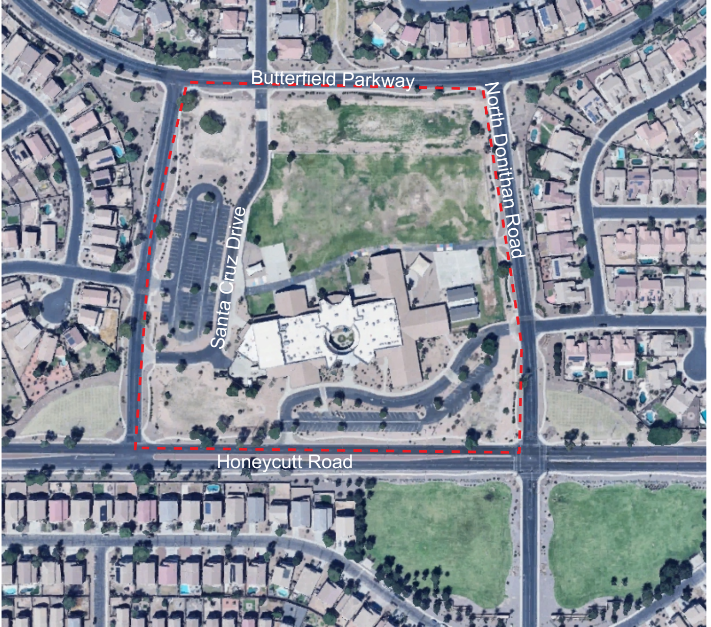
DIAGRAM NOT TO SCALE

Butterfield Elementary School 43800 West Honeycutt Road Maricopa, Arizona