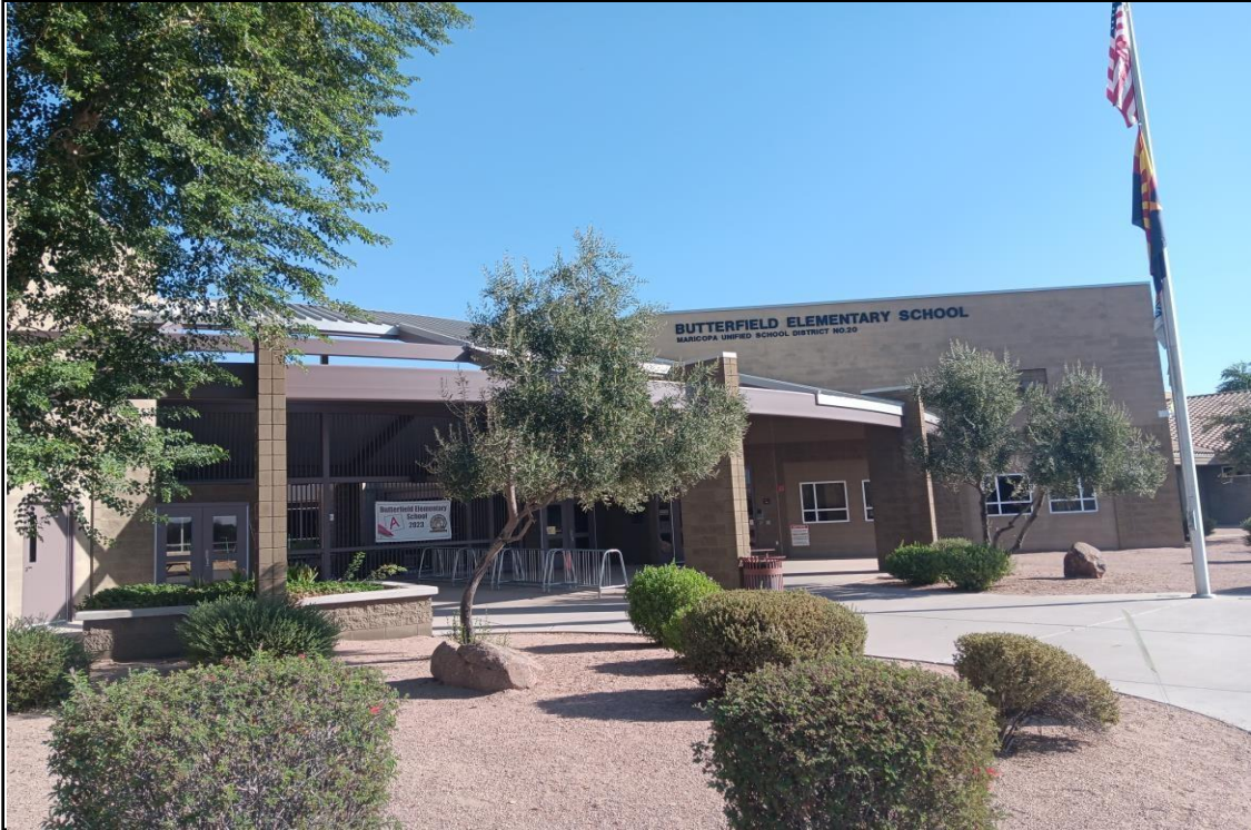
Picture 1 _ The front entrance to Butterfield Elementary School.