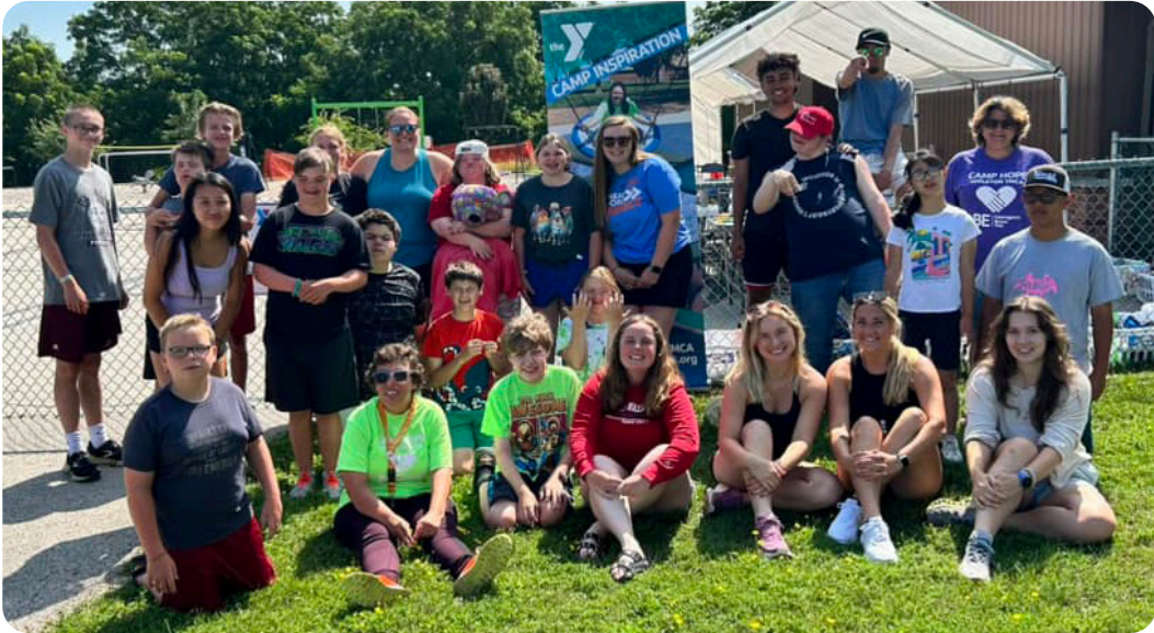
These camps are supported by the YMCA of the Fox Cities' Annual Campaign and United Way Fox Cities.