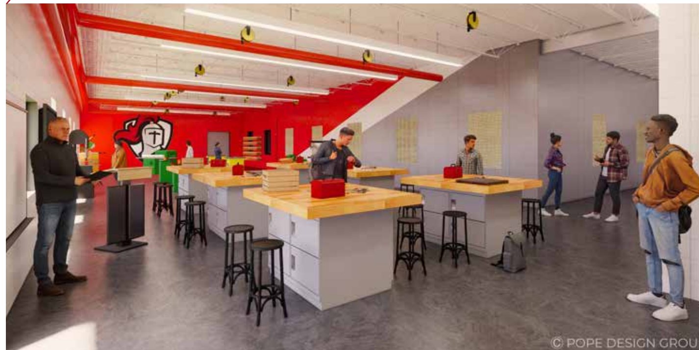
The above photo is an artist rendering of the classroom. The final building may look different.