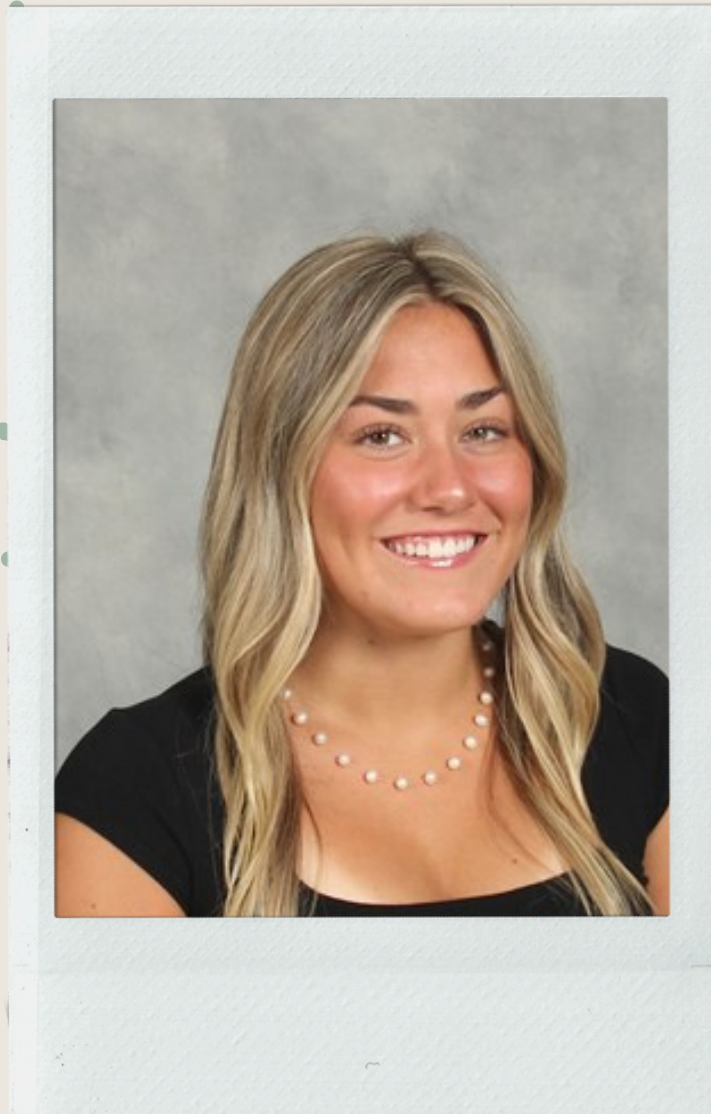
HEALTH/ PHYSICAL EDUCATION