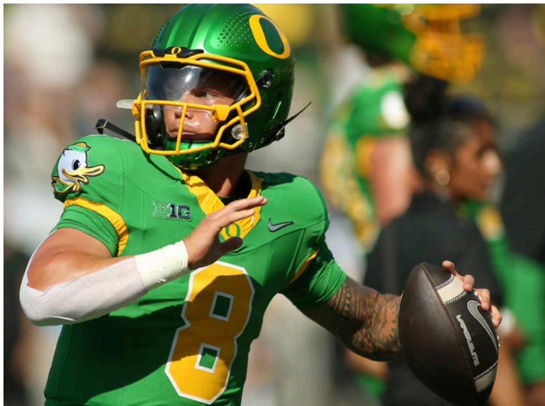
University of Oregon Ducks, Heisman Trophy Finalist