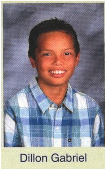
Pictured as an HFCA 6th-grader

If you are a college football fan, you know what a great season the University of Oregon Ducks had. Did you know quarterback Dillon Gabriel is an HFCA Wildcat? He recently shared a story about his time at HFCA and participating in our annual Kids Heart Challenge as a source of inspiration on a video produced by the Big Ten Network. HFCA is mentioned at the 3:30 mark, and the entire video is about a ten-minute watch, available here . For the eagle-eyed viewer, you may recognize a student jumping rope who now teaches at HFCA!