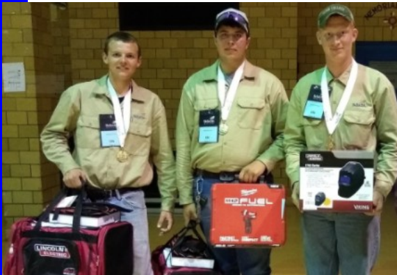
SkillsUSA competition winners with their prizes

CECIL COUNTY SCHOOL OF TECHNOLOGY 912 APPLETON ROAD ELKTON, MD 21921 PHONE: 410.392.8879 FAX: 410.392.8884 GUIDANCE OFFICE: 410.392.8880