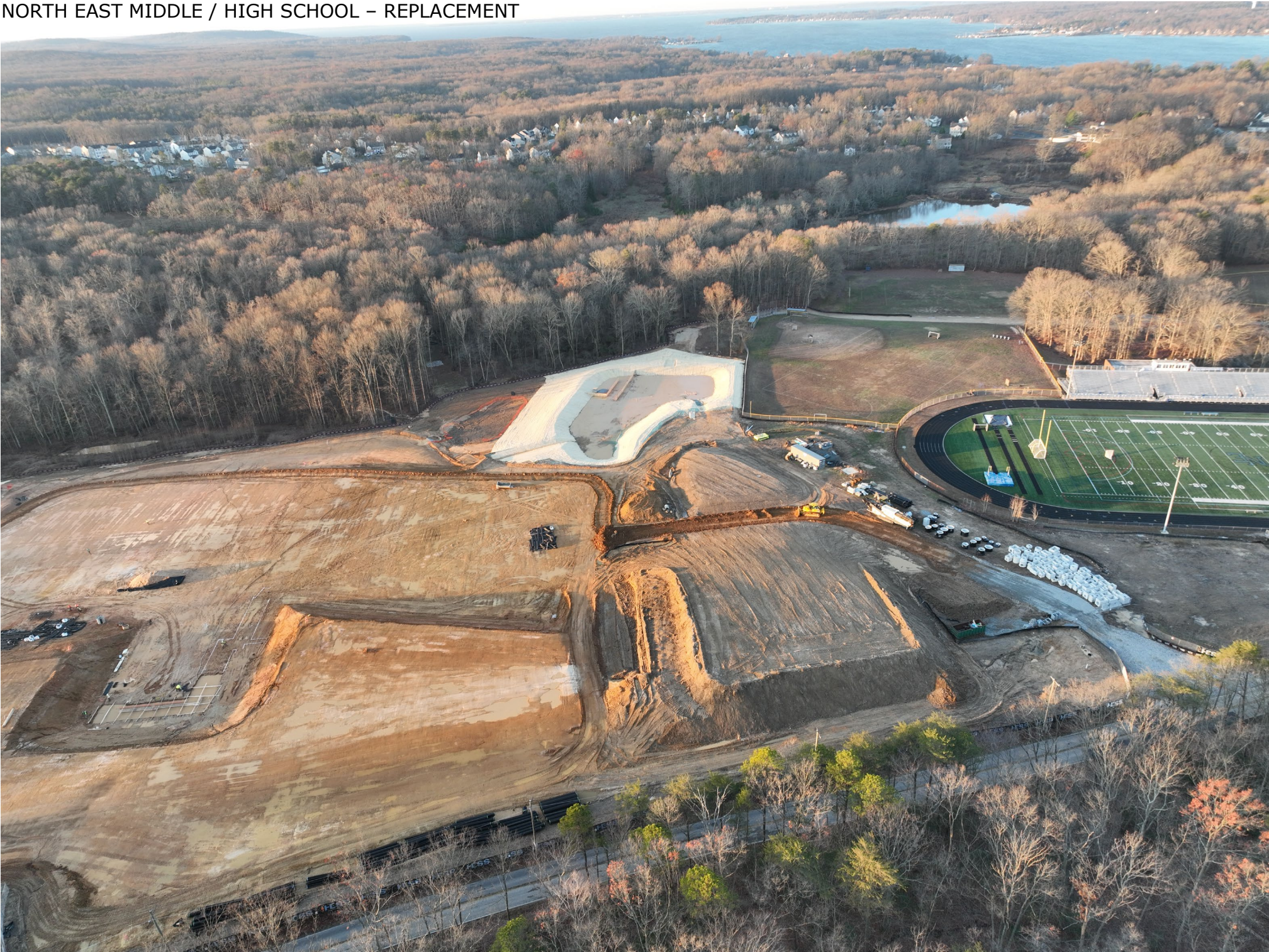
NORTH EAST MIDDLE / HIGH SCHOOL – REPLACEMENT