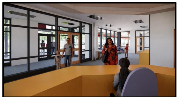
*Rendering represents design intent only and does not reflect final exterior finish selections*