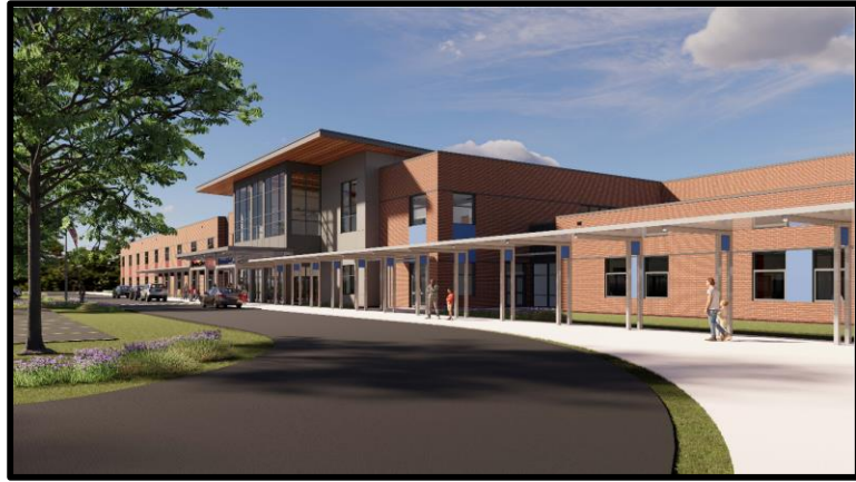
*Rendering represents design intent only and does not reflect final exterior finish selections*