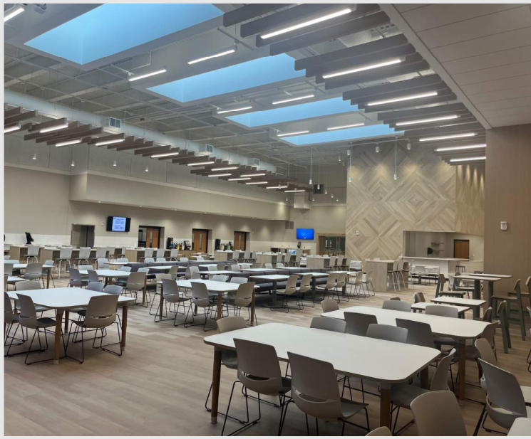
Top Left: a view across the High School Commons following furniture install with new skylights overhead