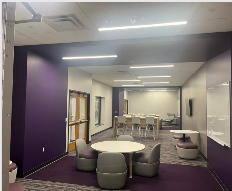
Bottom Left: a photo of the High School Student Lounge that underwent renovations with the Commons space