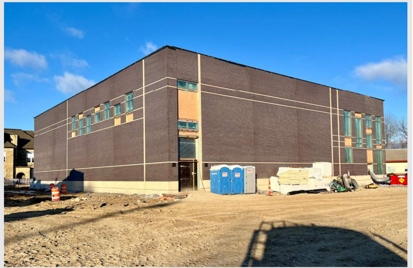
Above: view of the exterior of the River Bluff addition as the winter sunrise hits the completed brick façade

In the District Office, renovation work has begun in the second-floor restrooms. Both restrooms will be receiving new plumbing fixtures and finishes including tile, paint, and ceiling replacement. At the exterior of the District Office, Findorff masons have completed the brick masonry on the east elevation of the building and continue setting block for the elevator shaft at the lobby addition. Next week, foundations for the new generator and trash enclosure will begin.