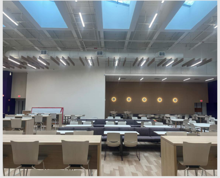
Top Right: another photo of the High School Commons space capturing the finishes in the newly renovated space