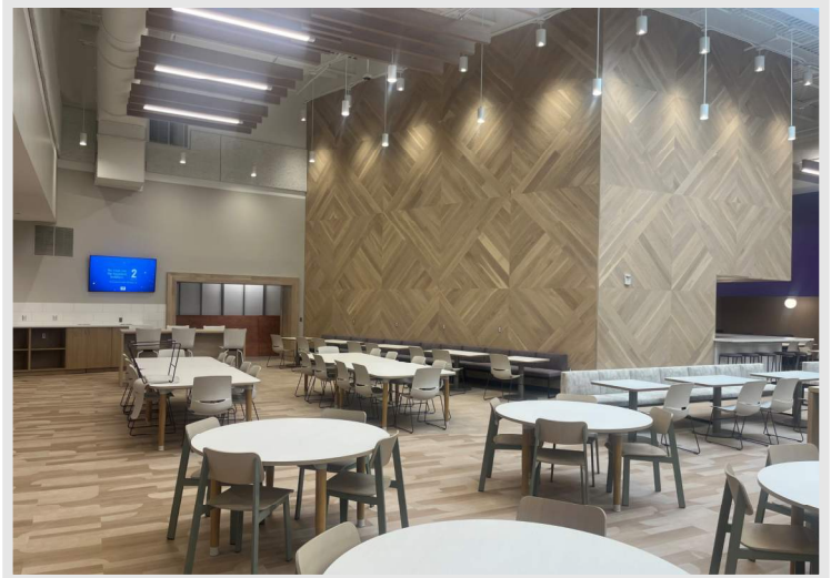
Bottom Right: a photo highlighting the amazing wood paneling feature wall in the Commons completed by the Findorff carpentry team