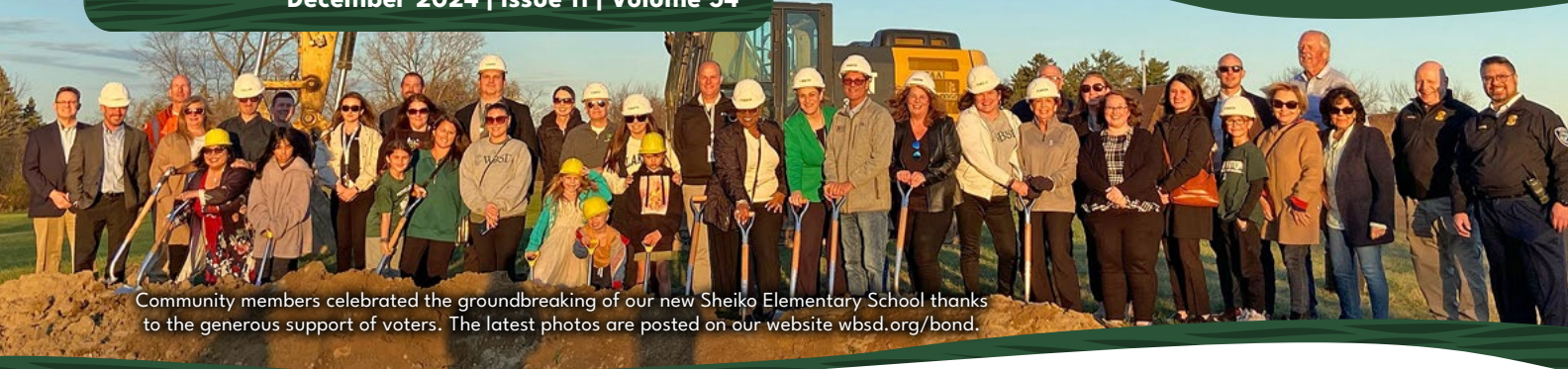
Community members celebrated the groundbreaking of our new Sheiko Elementary School thanks to the generous support of voters. The latest photos are posted on our website wbsd.org/bond .