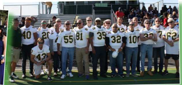
Some photos courtesy of The Westbury Times