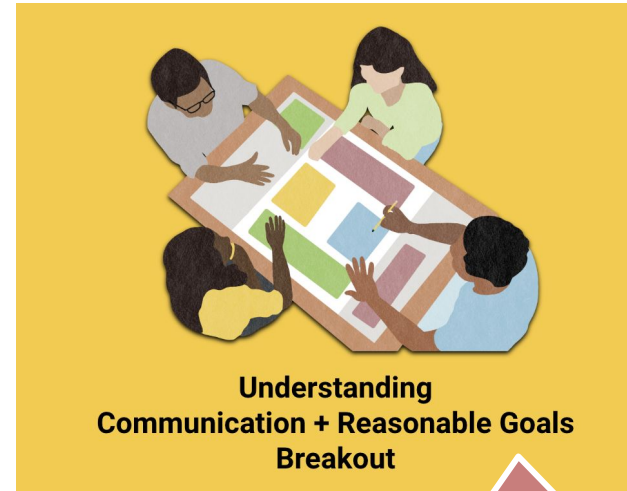
Understanding Communication + Reasonable Goals Breakout

School leaders engaged in short term, medium term, and longer term planning to ensure seamless integration of strategic plan initiatives with building-level work.