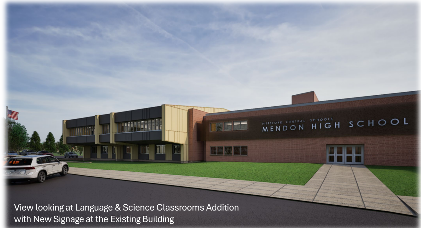
View looking at Language & Science Classrooms Addition with New Signage at the Existing Building