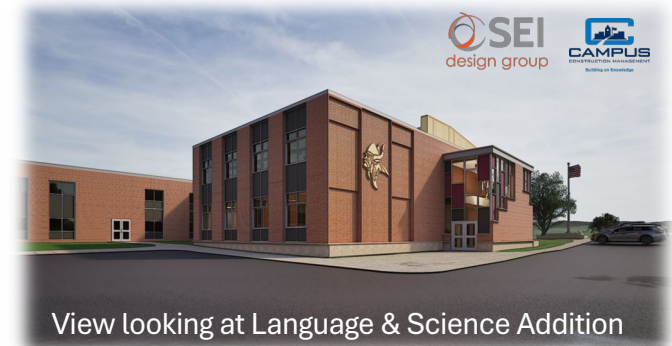
View looking at Language & Science Addition