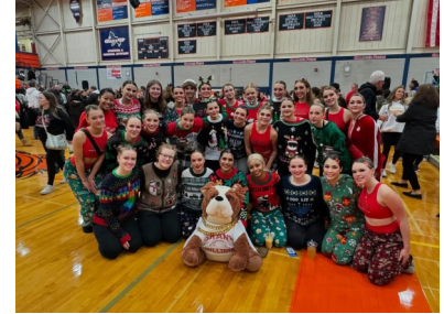
Grant Dance at Stagg Invite