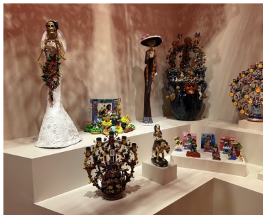
Display at The National Museum of Mexican Art.

took time to view some of the beautiful and intricate murals painted within the area.