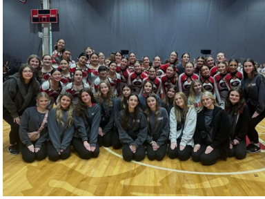
Grant Cheer at Jinglefest

Small and Large JV Cheer competed at Barrington High School's Jinglefest and had a blast debuting their competitive routines. Over the break, our Varsity Cheerleaders debuted their competitive routine in a new division at Rolling Meadows and finished the day in 6th Place. We can't wait to see them hit the mat again in January and cheer on the program throughout the season!