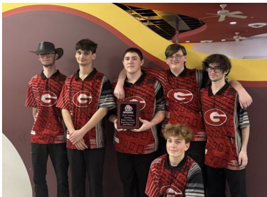
Varsity finishes in 3rd Place at their inaugural Bulldog Baker Holiday Invite.