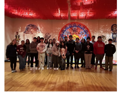
Students visit The National Museum of Mexican Art.

Earlier this year, our students participated in a guided tour of the Dia de los Muertos (Day of the Dead) exhibit at The National Museum of Mexican Art. At the completion of their tour, students were able to walk through the entire museum and explore all the exhibits, which included artifacts of Cesar Chavez, paintings by Diego Rivera, and the ofrenda wall. Some of our students added their own messages to the wall, writing notes about or to their loved ones who have passed away. After leaving the museum, they