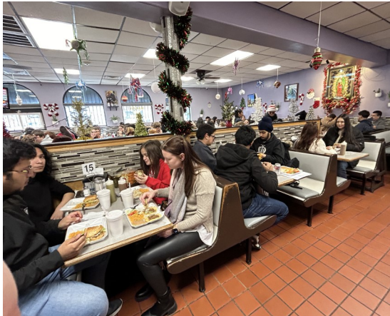
Students enjoy a delicious meal.

Our Bulldogs are getting ready for their next field trip to the Field Museum where they will learn about ancient civilizations of Latin America, and will participate in a hands-on class with a science expert, where they will analyze Mayan, Moche, Inca, and Aztec artifacts, among other great things! After their museum visit, they will have the opportunity to experience authentic Spanish cuisine. Keep an eye out for more updates on our Spanish 5 students as they continue to broaden their cultural horizons!