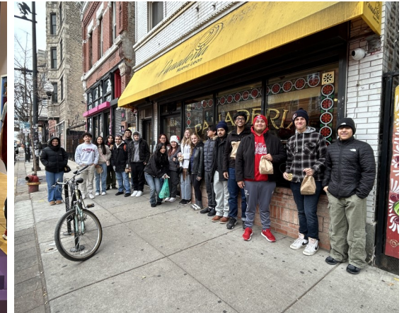
Students stop at Panadería for a sweet treat.