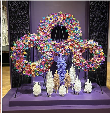
Display at The National Museum of Mexican Art.