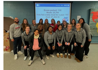
Varsity volunteers at Feed My Starving Children.

Our Girls Basketball program has been staying busy both on and off the court! Between practices and games, the Varsity team has shown incredible dedication to their sport. But their commitment doesn't stop there—they've also made time to give back to the community. Recently, the Varsity team took a break from their rigorous schedule to volunteer at Feed My Starving Children. Their efforts helped pack meals for those in need, demonstrating the values of teamwork and compassion that define our Bulldog athletes. We're so proud of how our Bulldogs represent Grant both in competition and in the community. Keep up the great work!