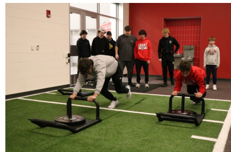
Student-athletes test out new weight room equipment.

Packed with modern equipment and spacious layouts, the facility is ready to support our Bulldogs in reaching their full potential.