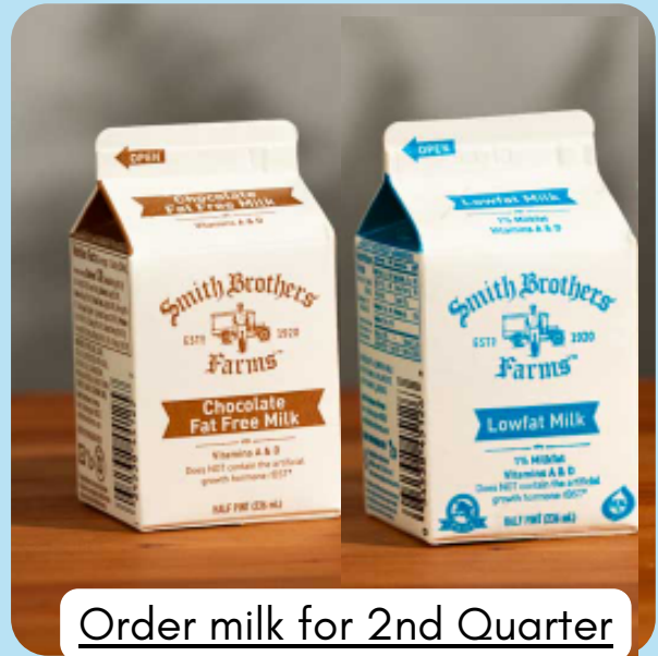
Order milk for 2nd Quarter