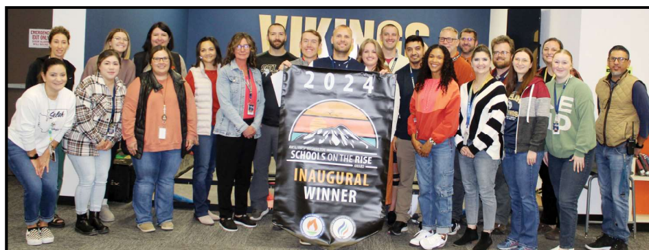
Selah High School has been honored with a Washington Schools On the Rise award.