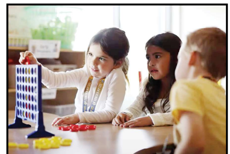
Robert Lince Early Learning Center students are establishing a foundation on which to stack the building blocks to their future.

The year's first installment highlights the Robert Lince Early Learning Center. Amidst their eagerness to learn and grow, Selah's littlest learners are discovering how to become students, and they are establishing a foundation on which to stack the building blocks to their future. Access the QR code for viewing options in English and Spanish.