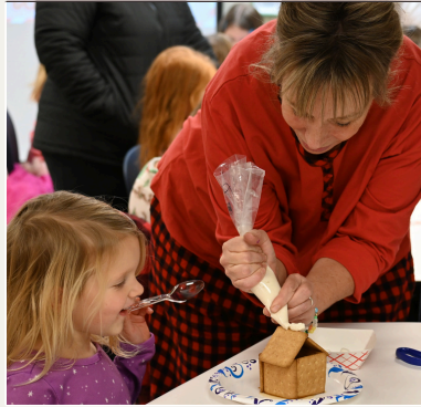
Homeworks! students create their own gingerbread houses as part of Winterfest on Dec. 19.