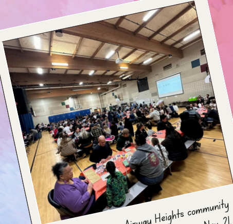
Sunset families & Airway Heights community members gather for Turkey Bingo on Nov. 21.