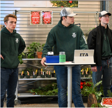
Cheney High School FFA members working their booth at the Cheney Blackhawk Boosters Craft Fair on Dec. 7.