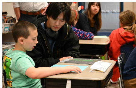
Betz Elementary students read with EWU AUAP students