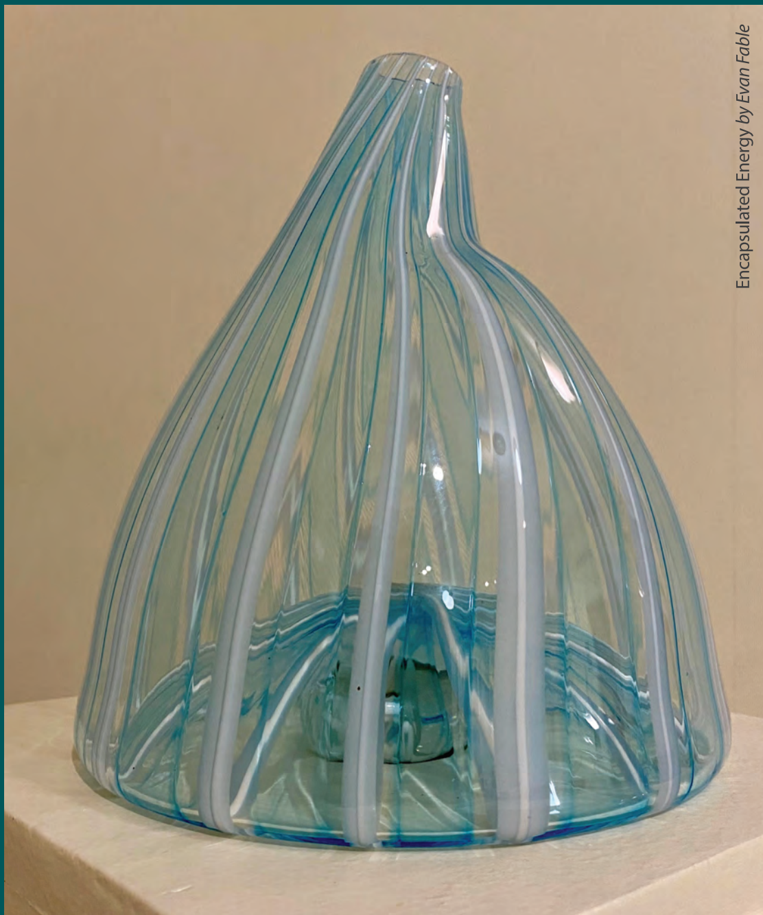
Encapsulated Energy by Evan Fable