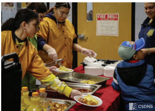
ProStart Culinary Team serves breakfast to NBHS Student of the Quarter honorees and their families