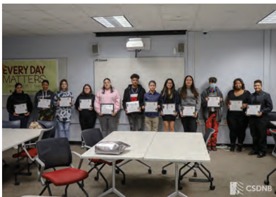
Group photo of NBHS Students of the Quarter

New Britain High School was happy to celebrate 16 outstanding students on Friday at their Student of the Quarter Breakfast. Students and their families joined us for a delicious breakfast, catered by our ProStart Culinary Team, which was then followed by the presentation of awards. Students were selected for this award by different departments in the building for their perseverance, hard work, and overall positive impact on our school community. A big thank you to our families for supporting these students in their success!