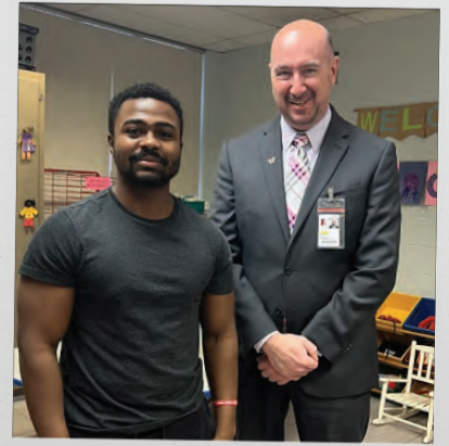
Nicholas Kerr Roosevelt Early Learning Center