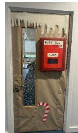
8CKA Form Room (Miss Virtue)