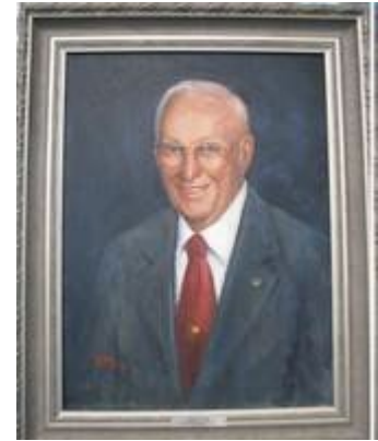
Henry W. Sory Elementary