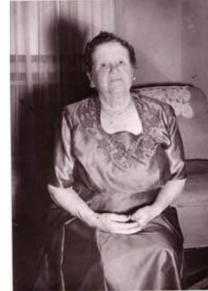
Dillingham Elementary School