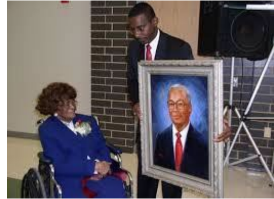
Percy W. Neblett Elementary