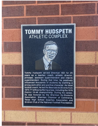
Tommy Hudspeth Athletic Complex