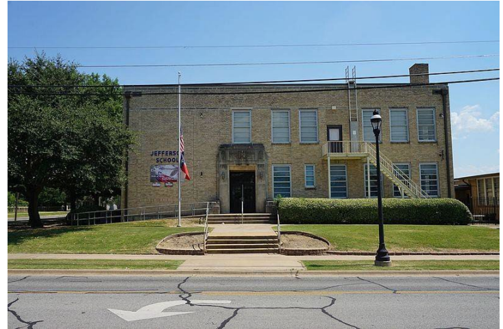
Jefferson Learning Center