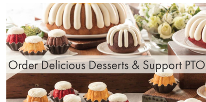
Order Delicious Desserts & Support PTO