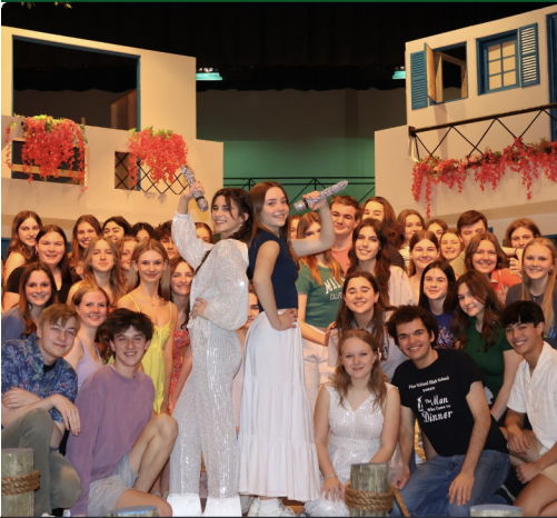
The High School performed Mamma Mia for the spring musical, and it is safe to say it was an absolute hit!