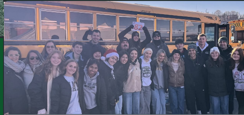
Student Government led the district in the annual Stuff-a-Bus toy drive and helped fill 82 buses.