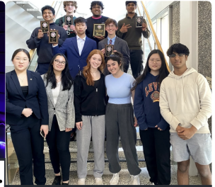
Forensics earned the Small School Sweepstakes Award in March.