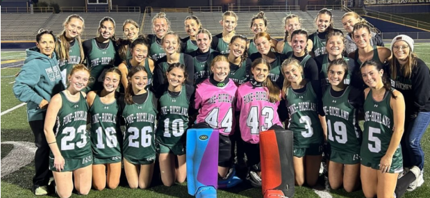
Field Hockey won the WPIALS!