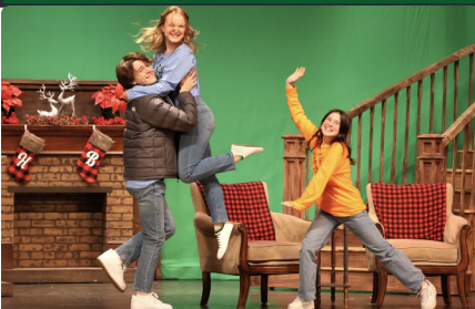
Students performed in The Holiday Channel Christmas Movie Wonderthon .