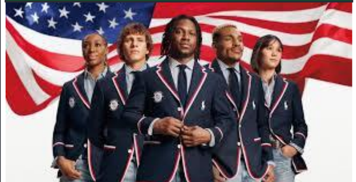
The United States dominated the 2024 Olympics with a total of 126 medals