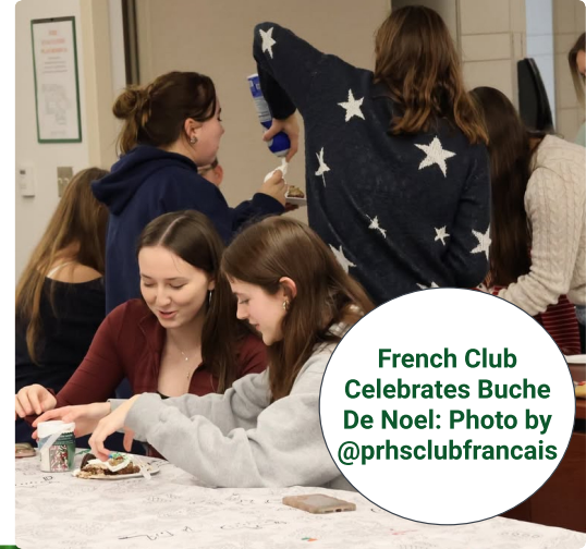
French Club Celebrates Buche De Noel: Photo by @prhsclubfrançais