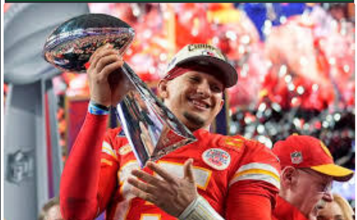
The Kansas City Chiefs became back-to-back Superbowl Champions