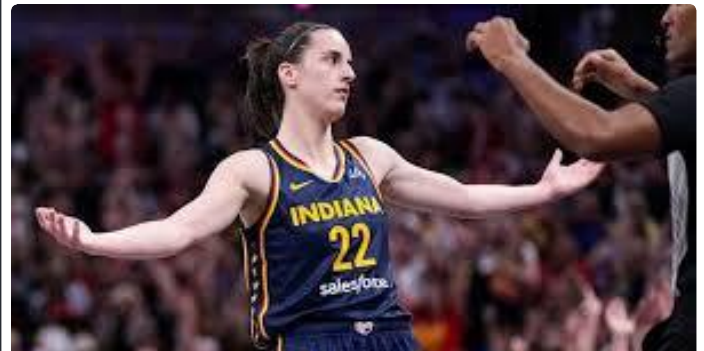
Caitlin Clark became the all-time leading scorer in NCAA basketball.

the Clemson Tigers battled with the SMU Mustangs. Clemson was faced with a win-and-in situation, and in this situation, the Tigers had to win the ACC for any chance at qualifying. SMU, on the other hand, needed to show the committee that they belonged regardless of the outcome. Clemson would start off firing on all cylinders, building a commanding 24-7 lead at halftime. Things were looking grim for the SMU as their playoff chances were uncertain, but the Ponies fought back to tie the game at 31-31 with 0:16 seconds remaining in the game. The Tigers would walk it off with a Clemson-record 56-yard field goal to head to the College Football Playoffs 34-31. The morning after was Decision Day; the committee had set up the final bracket. Oregon, Georgia, Arizona State, and Boise State took the top four spots as the highest-ranked conference champs. The final seven teams were pinned against each other in the first round. Tennessee will go up north to take on Ohio State in Columbus; Clemson will go to Austin for the first time to take on Texas; SMU will travel to Happy Valley against Penn State; and Indiana will take an in-state trip to South Bend to take on Notre Dame. This season has been chaotic, to say the least, with ups and downs all year for every team. With the Championship game just over a month away, all 12 teams believe they have what it takes to hoist the trophy in Atlanta.