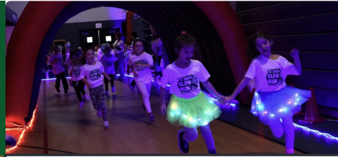
Hance students raised over $27,000 for the school PTO in January.

In the spirit of the year 2024 coming to an end, we want to reflect on the remarkable year we have had as a PR community! Here are some highlights.