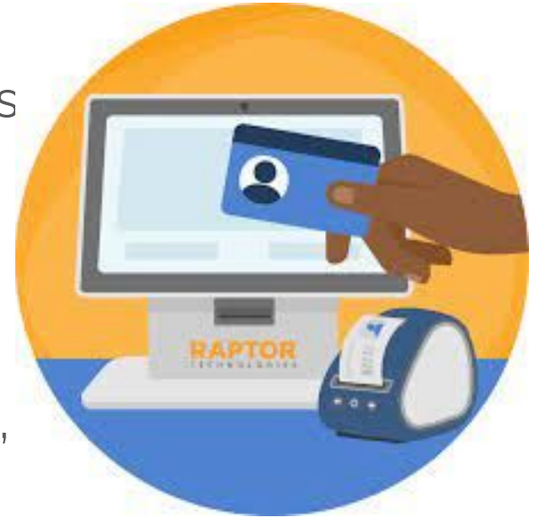
Raptor Visitor Management System