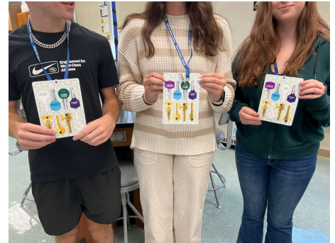
National Teach Ag Day lesson - learning about what Ag Teachers do everyday!