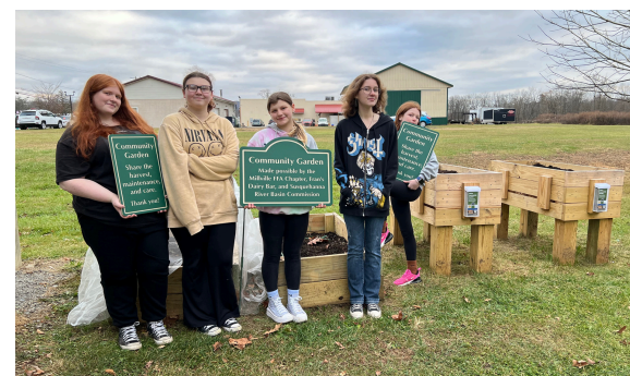
Thanks to our November community service crew for "winterizing" the Fran's Community Gardens!