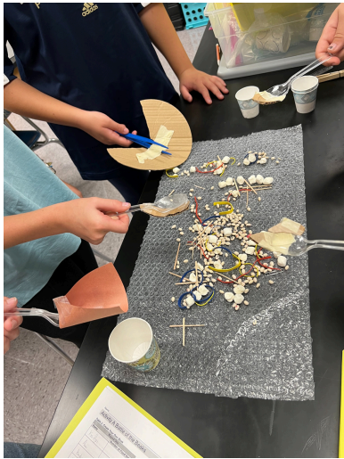
(Left) 8th Grade students learn about natural selection during the Build-a-Better Beak challenge.

Have you ever wondered what being in an agriculture class is like? Check out some of these AG-mazing activities!