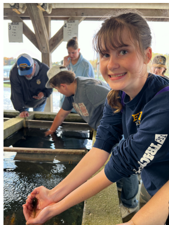
Learning about macroinvertebrates