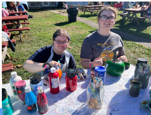
(Below) Having fun painting pumpkins at Rohrbach's!