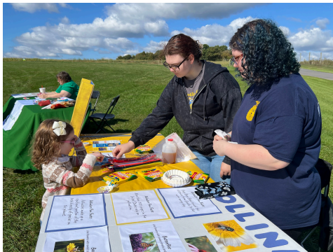
Teaching kids about pollinators at Ag Encounter Day