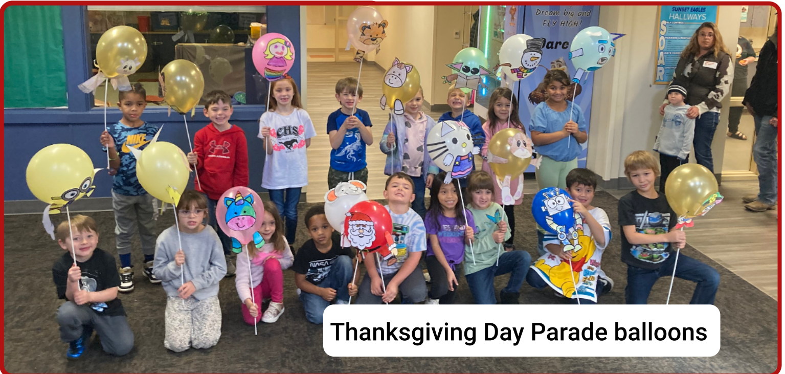
Thanksgiving Day Parade balloons