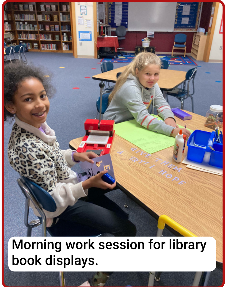
Morning work session for library book displays.

If your student eats breakfast in the cafeteria you are welcome to join them.