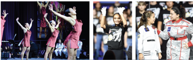
Students in Tomball ISD enjoy many opportunities to pursue their interests in the fine arts.