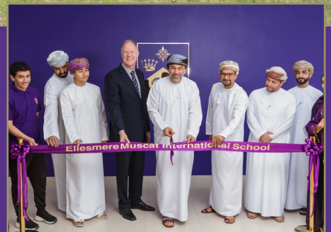
The Opening of Ellesmere Muscat Page 14

Ellesmere College Newsletter Lent/Summer 2024