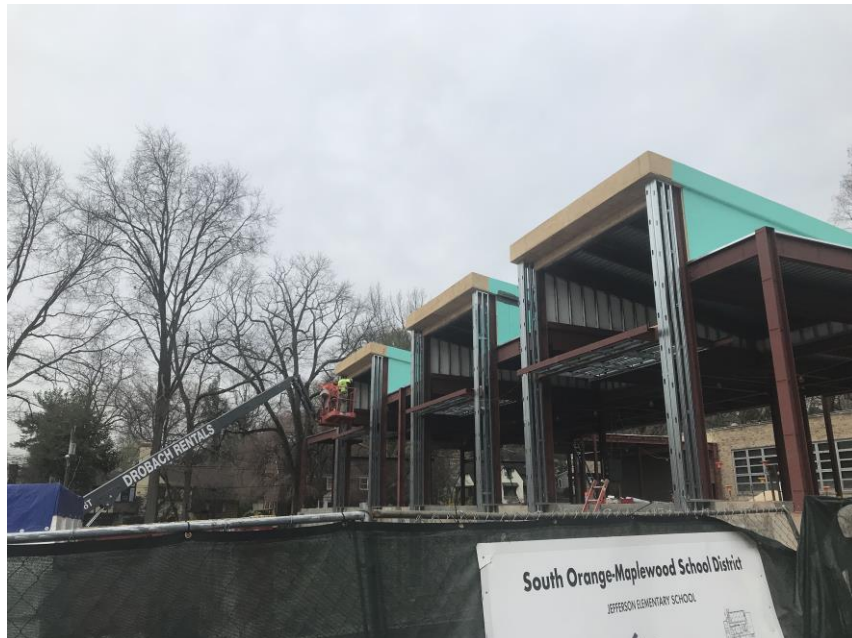
Framing at exterior columns underway - Jefferson Elementary