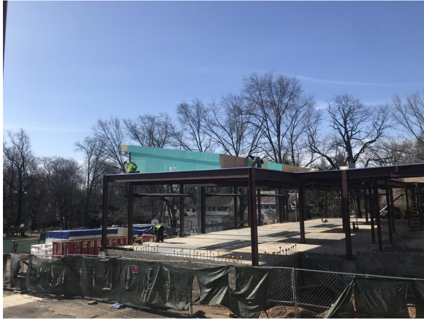
Continued with metal framing and plywood and sealing - Jefferson Elementary School