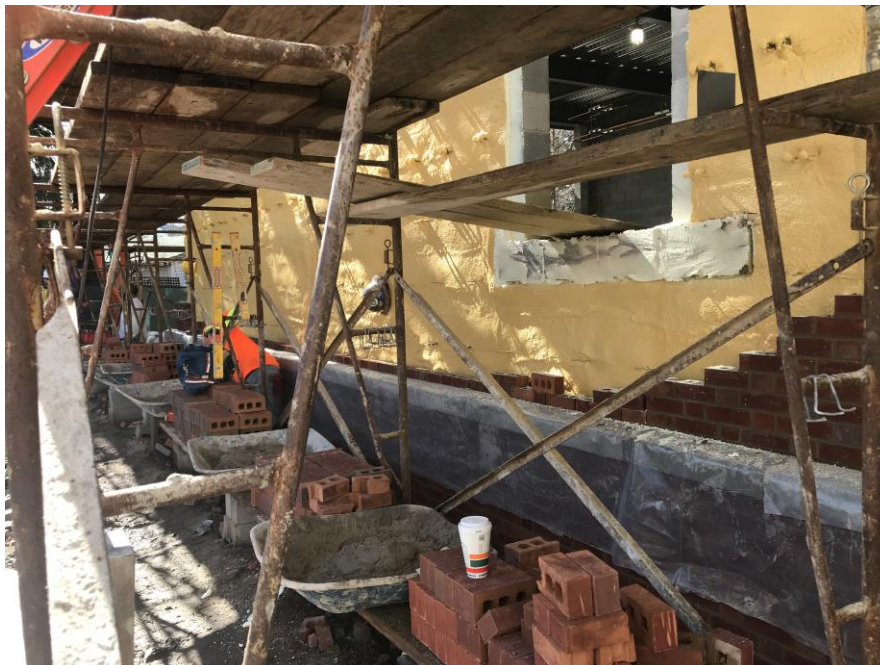
Brick veneer wall at Area C underway - Clinton Elementary School