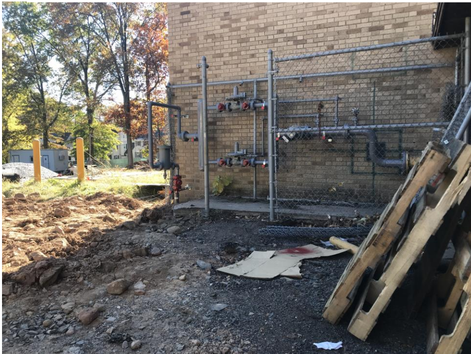
New gas Meter completed - Jefferson Elementary School