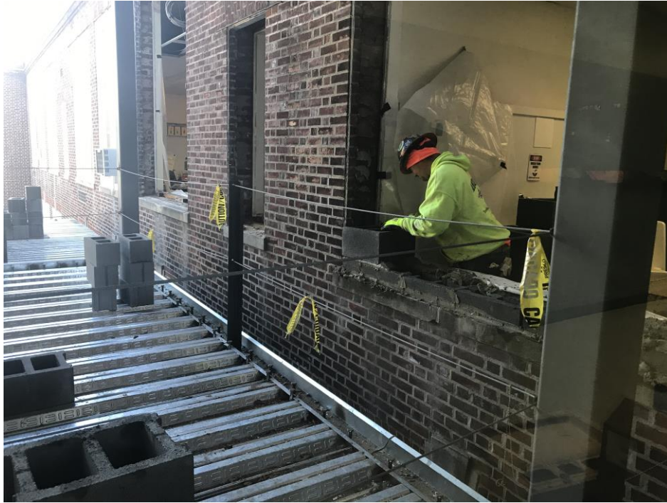
Masons infilling Window Opening – Clinton Elementary School