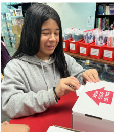
Placing the ballot in the ballot box

On November 5th our 3rd, 4th, and 5th grade students participated in a mock election! They learned about what it means to vote, the voting process in the United States, and they voted in a mock election here at school. This was part of a state wide initiative through the Minnesota Office of the Secretary of the State and Students Voting Minnesota to educate K-12 students about the importance of voting. You can see the statewide results from the mock election here!