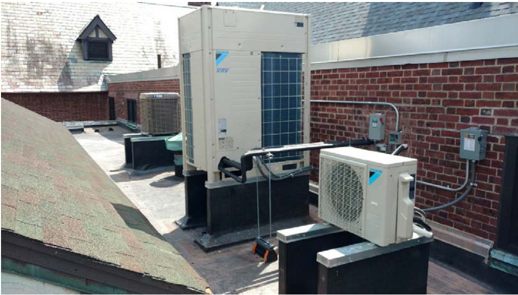
Tuscan School- Exterior HVAC Condensers