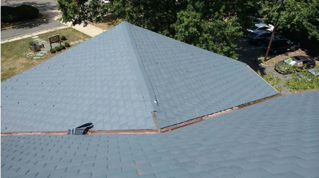
Seth Boyden School- Auditorium Roof