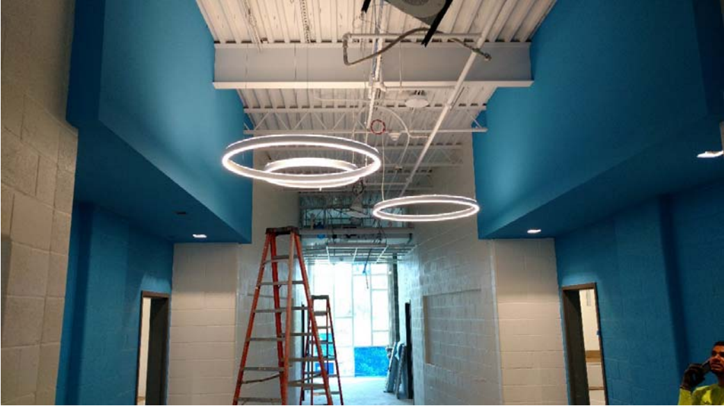
Seth Boyden School- Second Floor Corridor