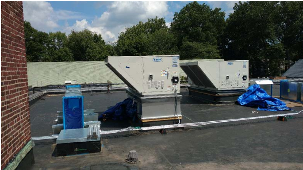
Tuscan School- Gym/Auditorium RTU