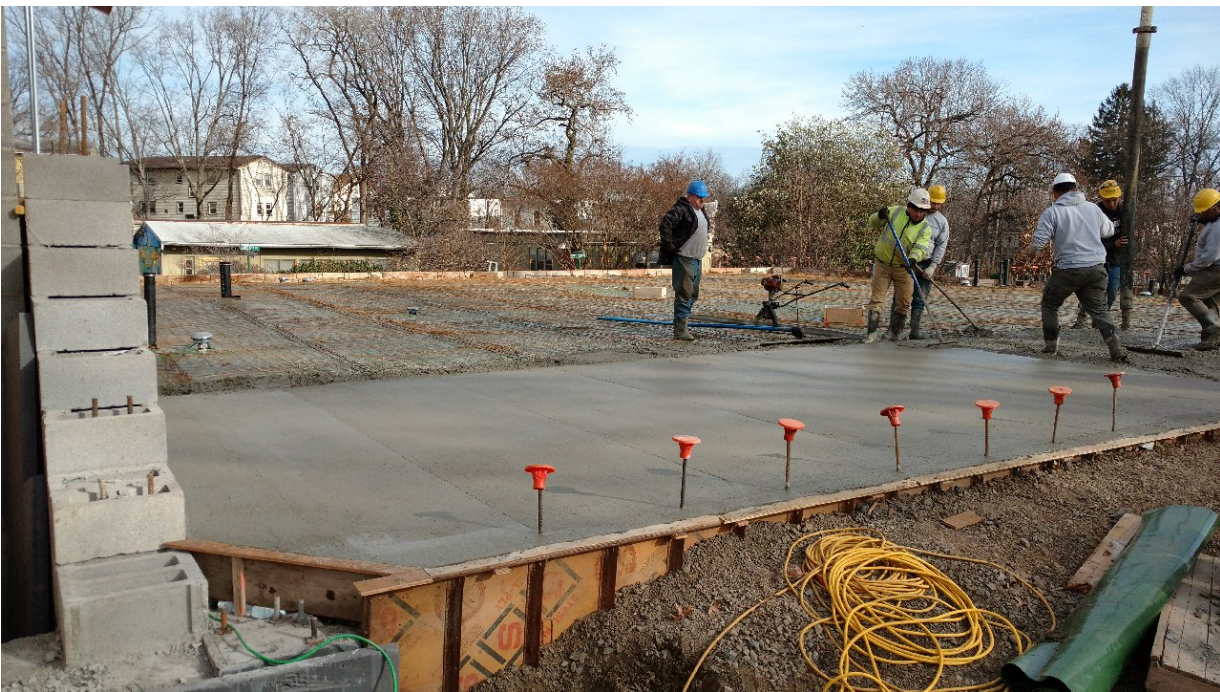
Seth Boyden - Concrete Placement