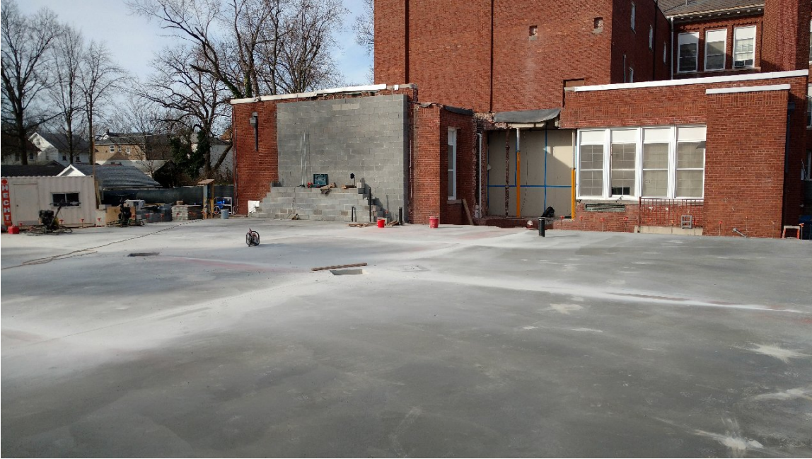
Seth Boyden - Saw cut slab on grade