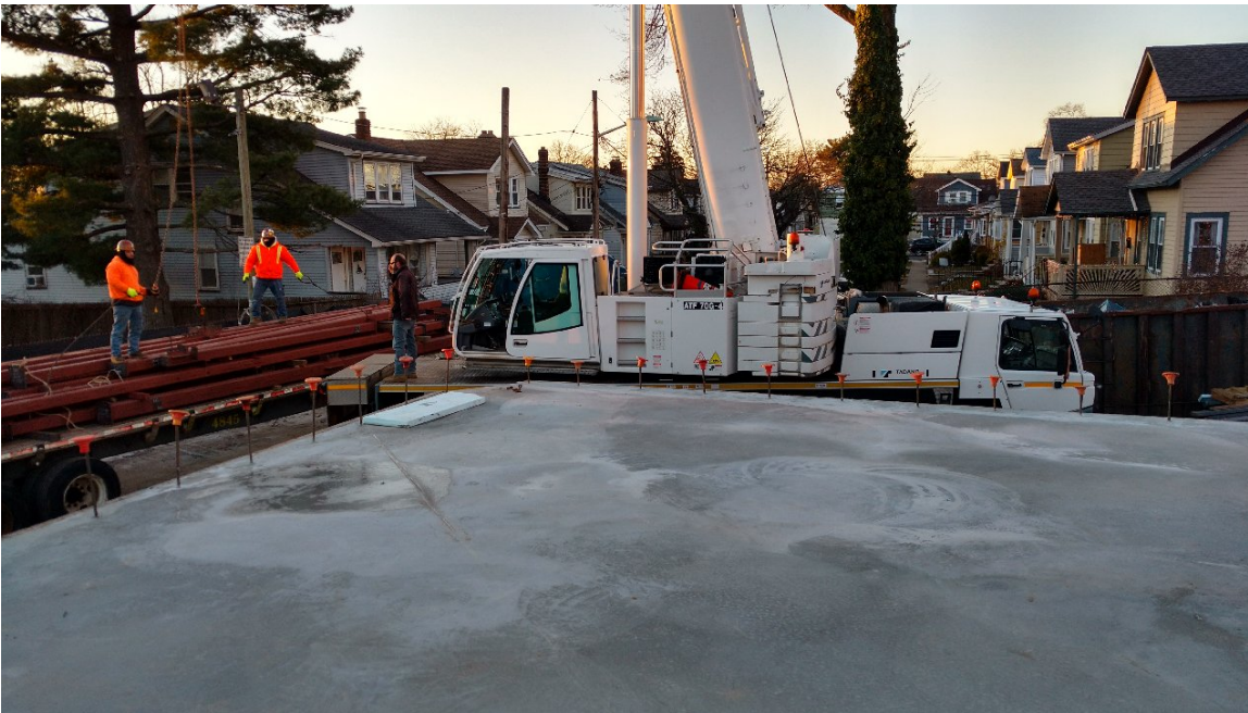
Seth Boyden - Structural Steel Installation