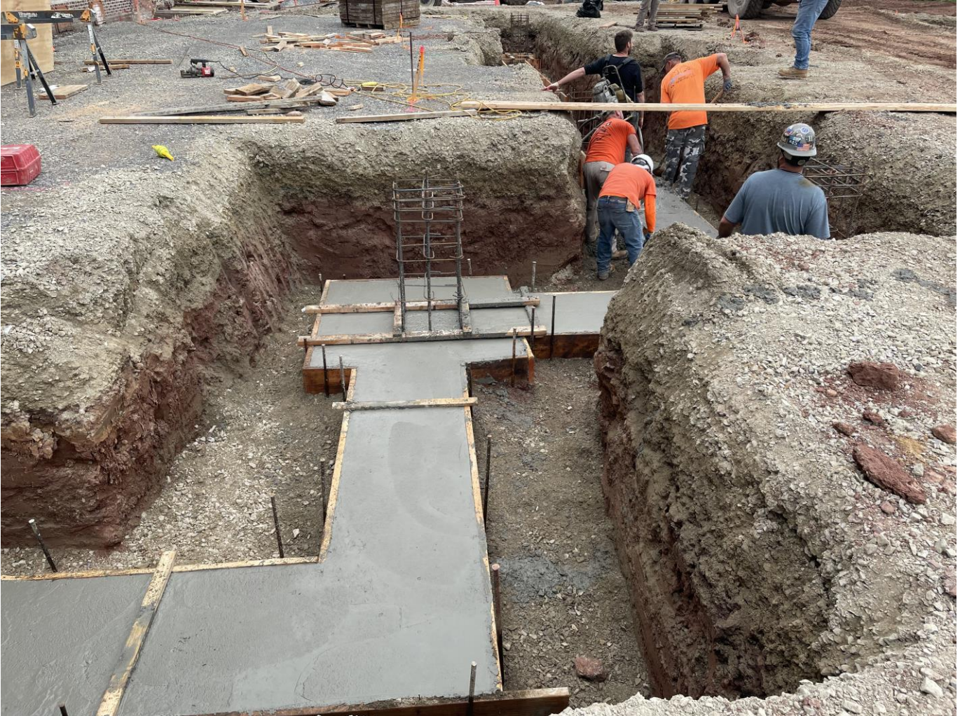
Pour concrete footings