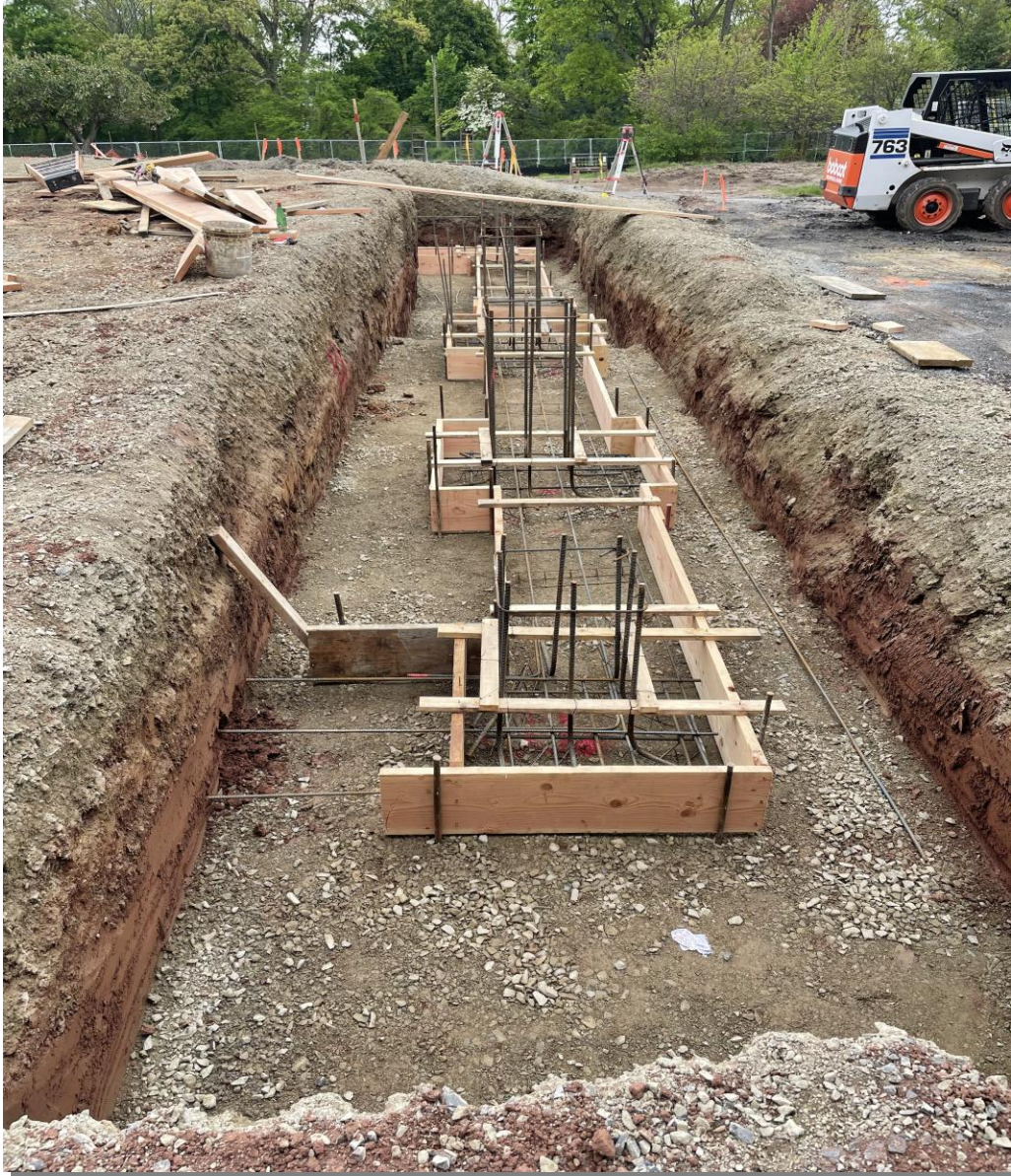
Footing forms and rebar