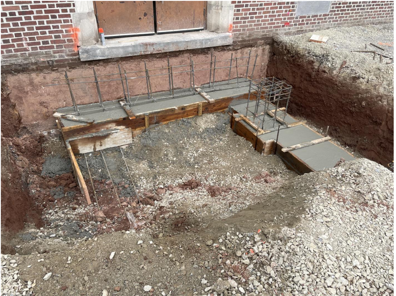
Poured concrete footings