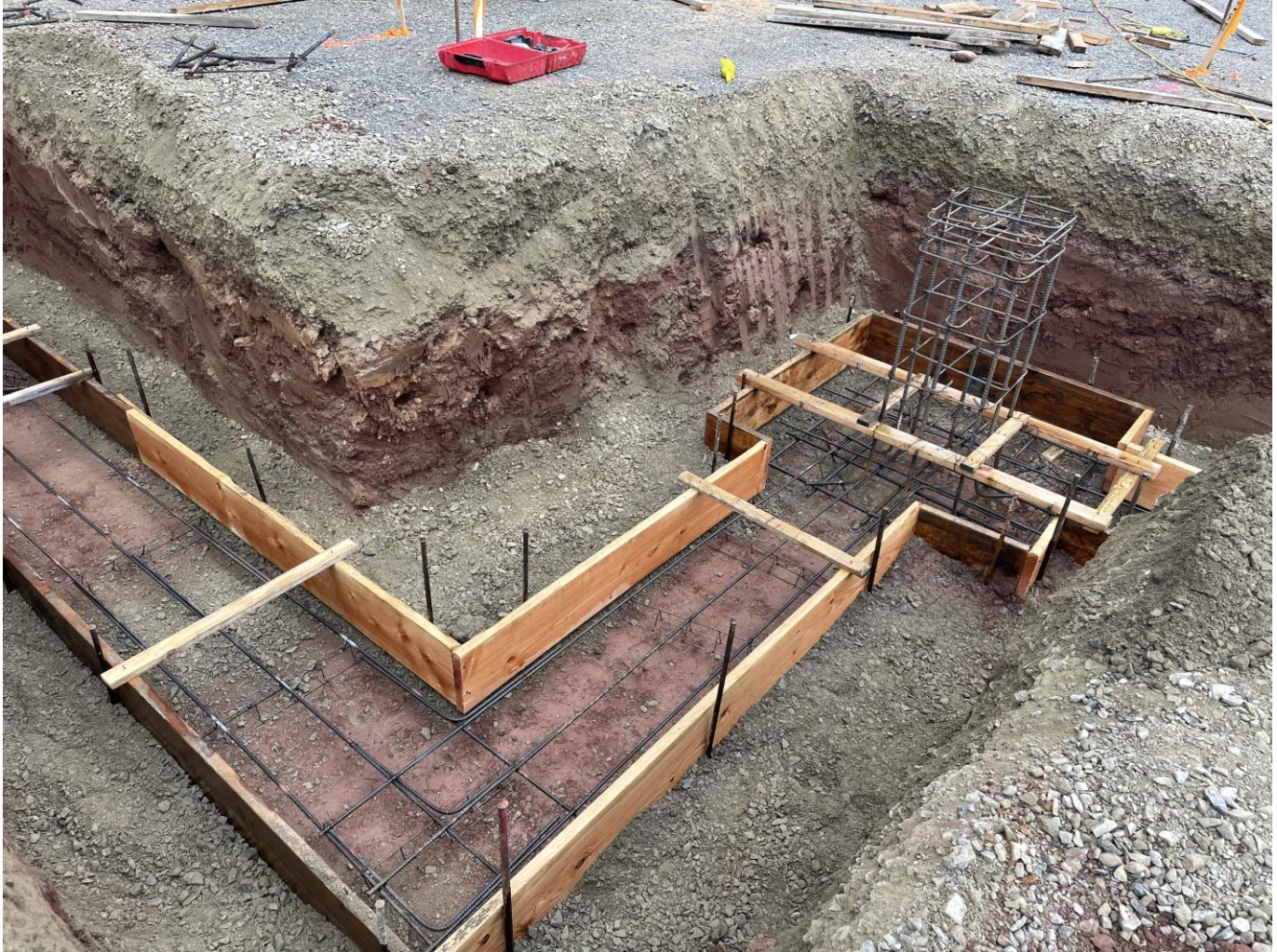
Footings and rebar