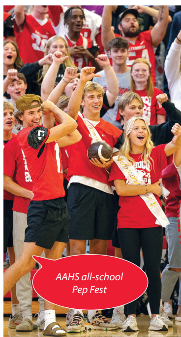
AAHS all-school Pep Fest