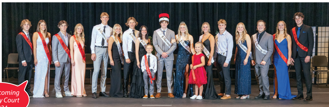
Homecoming Royalty Court 2024