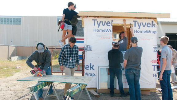
Alexandria Area High School Building Trades students at work on the shelter structure.

Alexandria Area High School Building Trades students are helping to fill a community need by building a shelter structure designed by McCarten Design with materials donated by Hilltop Lumber. The shelter will ensure this year’s Garden of Lights volunteers will be warm.