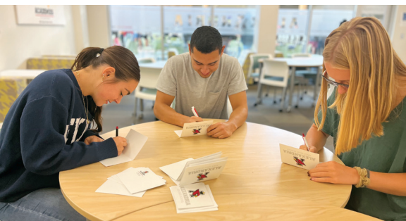
AAHS National Honor Society students writing gratitude notes to area veterans.

Brought to you by the Friends of Christmas, Garden of Lights is a walk-through festive light display in the Legacy Gardens that will run the length of the holiday season.