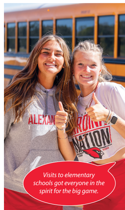
Visits to elementary schools got everyone in the spirit for the big game.