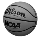
Photo Creds: Emily Neuenschwander and Wilson Custom Basketballs- Build Your Own Custom Basketball

After the girls win against Poland they have been hard at work. The girls have been “ballin’ out” during their practices. Recently, the girls were supposed to have a game against Frankfort Schuyler but unfortunately, it was postponed multiple times. The team is still putting in the work at practice because they face Lafargeville home on Saturday, December 14th, 2024 at noon. Good luck girls and keep up the great work!