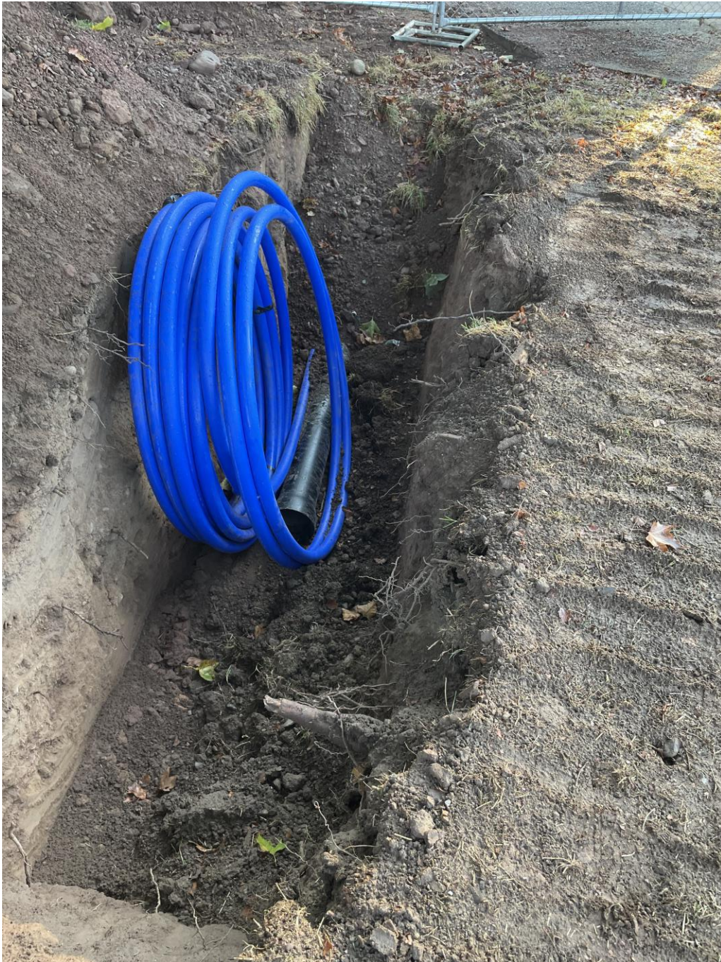
Domestic water and Fire suppression for SME