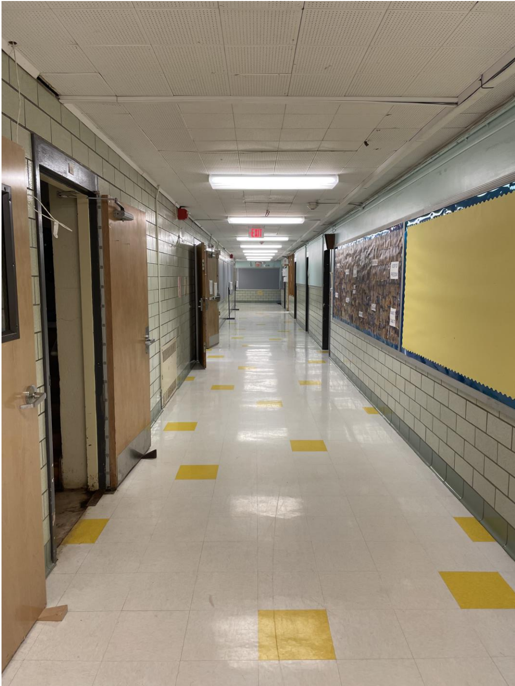
SMA cleaned up for fall season