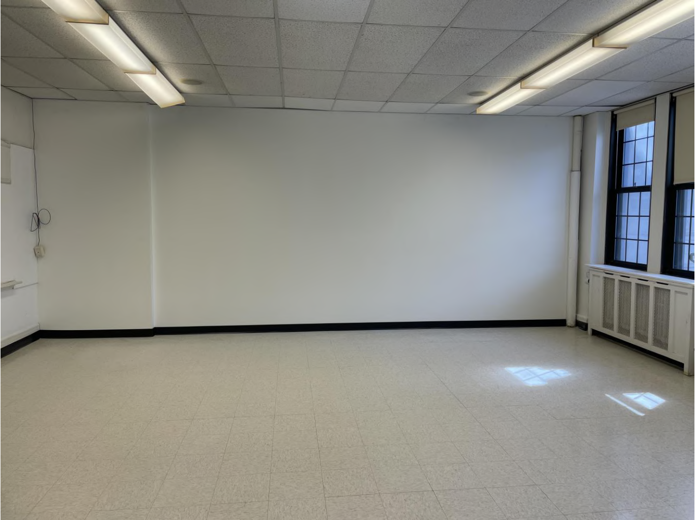
Proposed walls for new connecting corridor to addition at SME