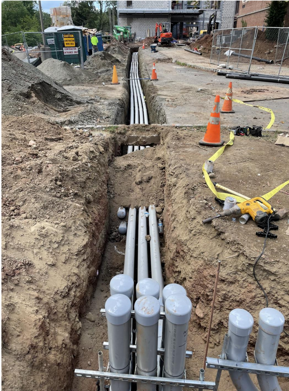
Secondary electrical conduit at SME