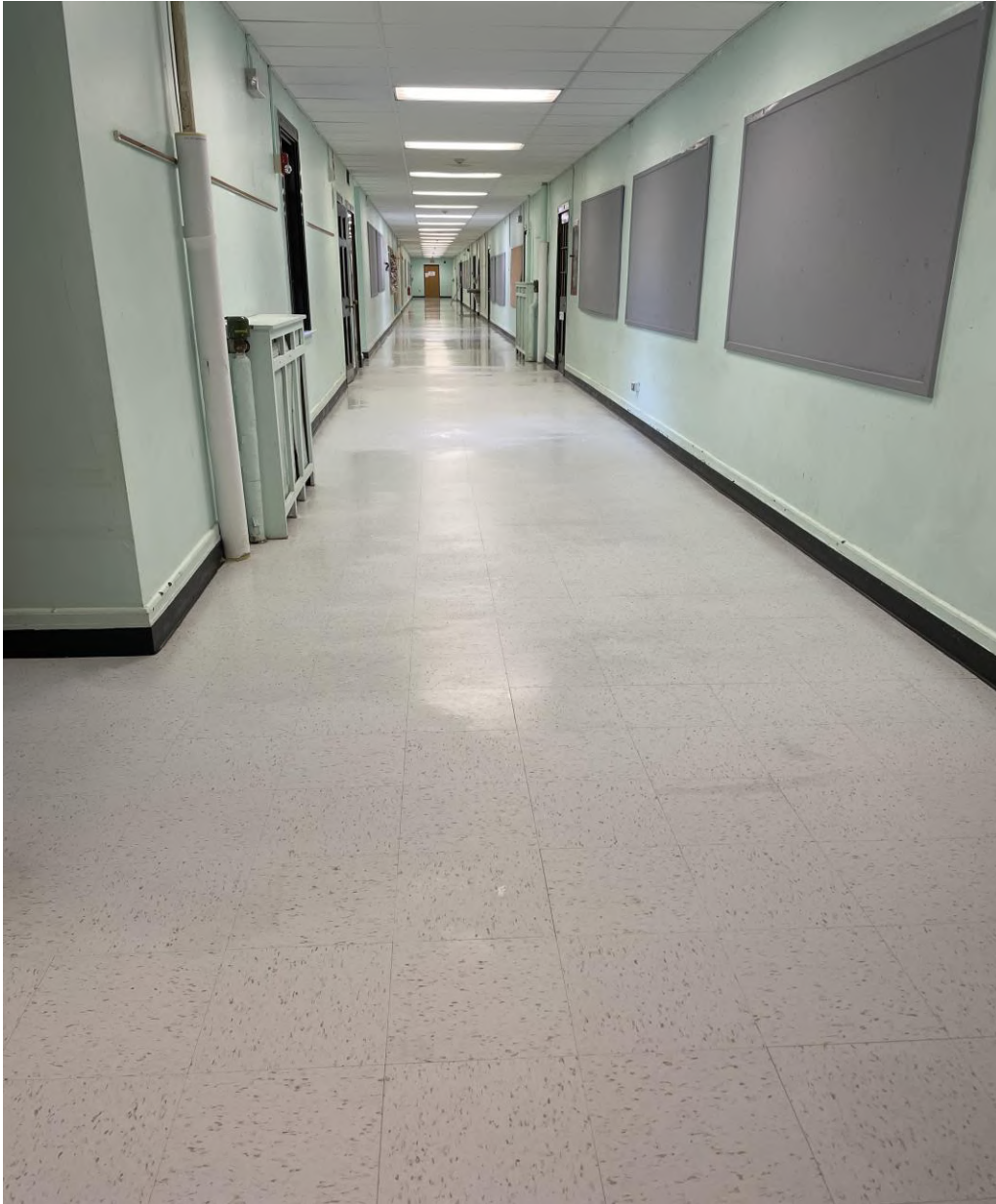
Ceiling completed/All devices & fixtures reinstalled