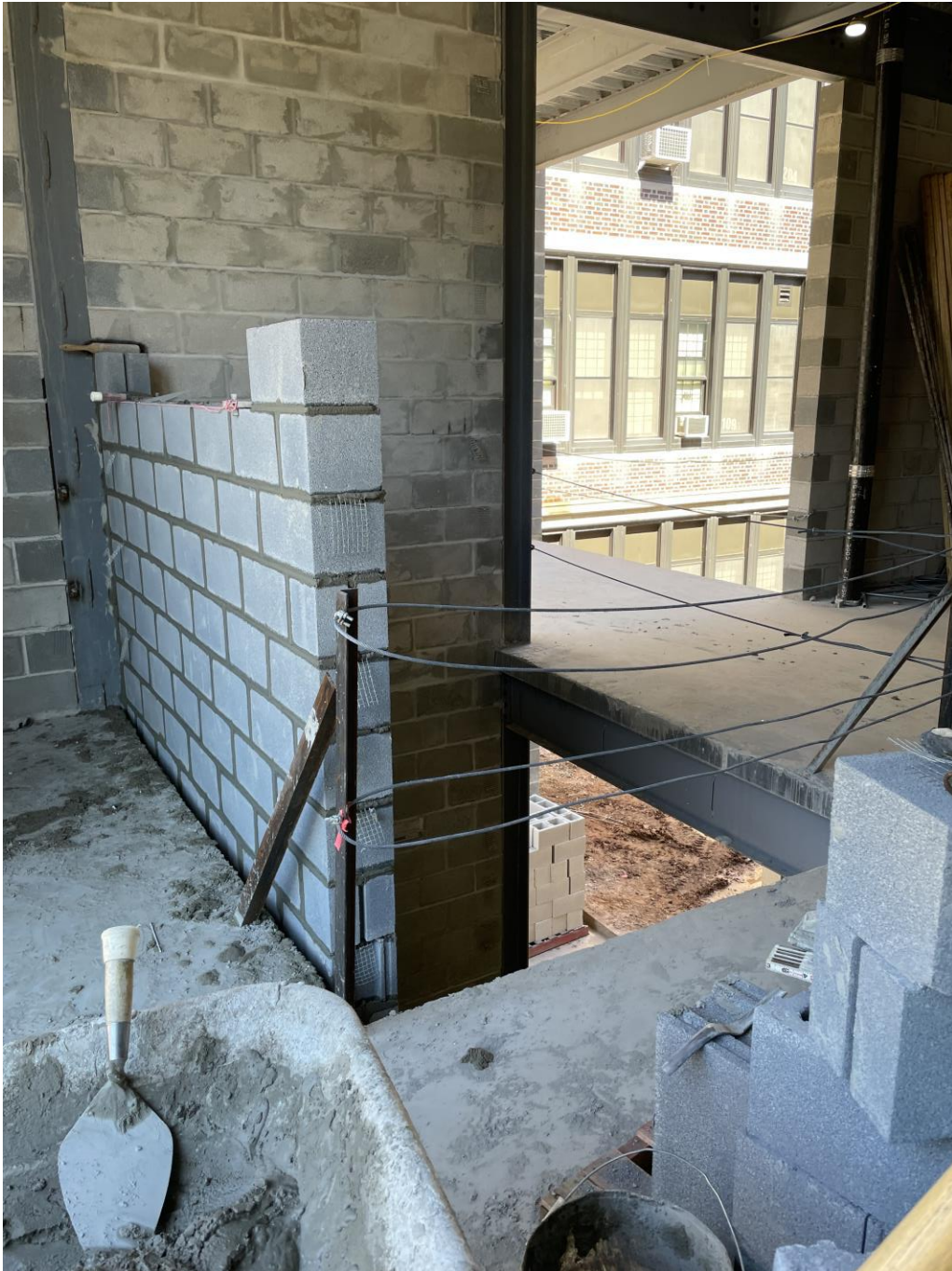
Proposed elevator shaft at SME