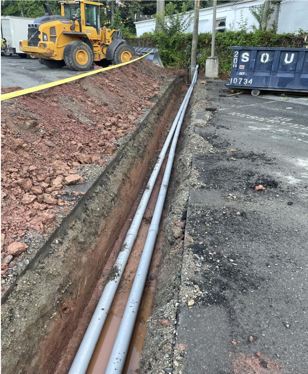
Primary electrical conduit at SME/ New riser pole set by PSE&G