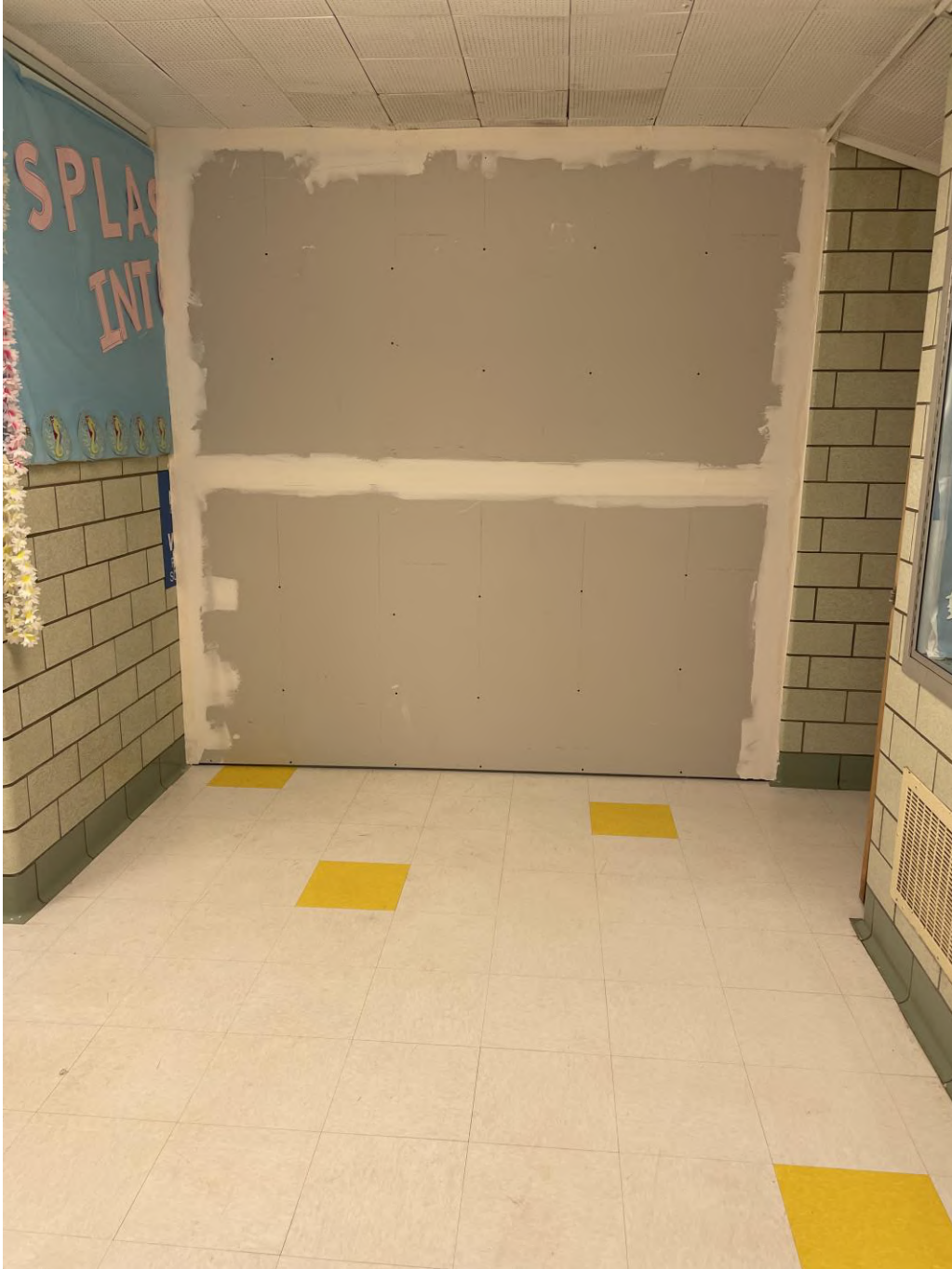
Temporary partition wall at SMA