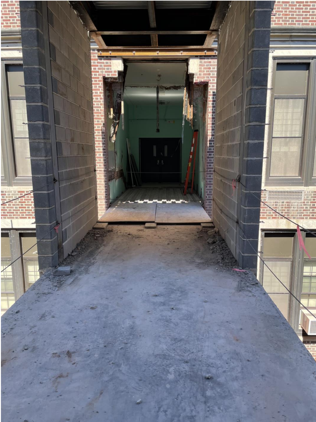
Existing block/brick sawcut and removed for proposed connecting corridor at SME