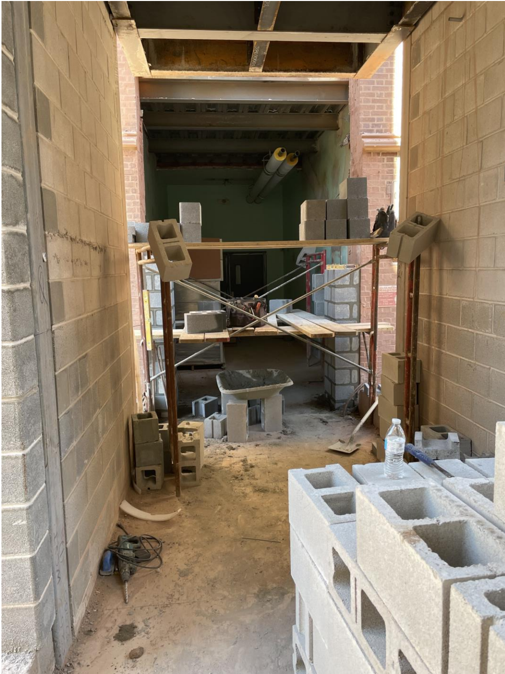
Block wall removed/ Construction of Fire wall at SME