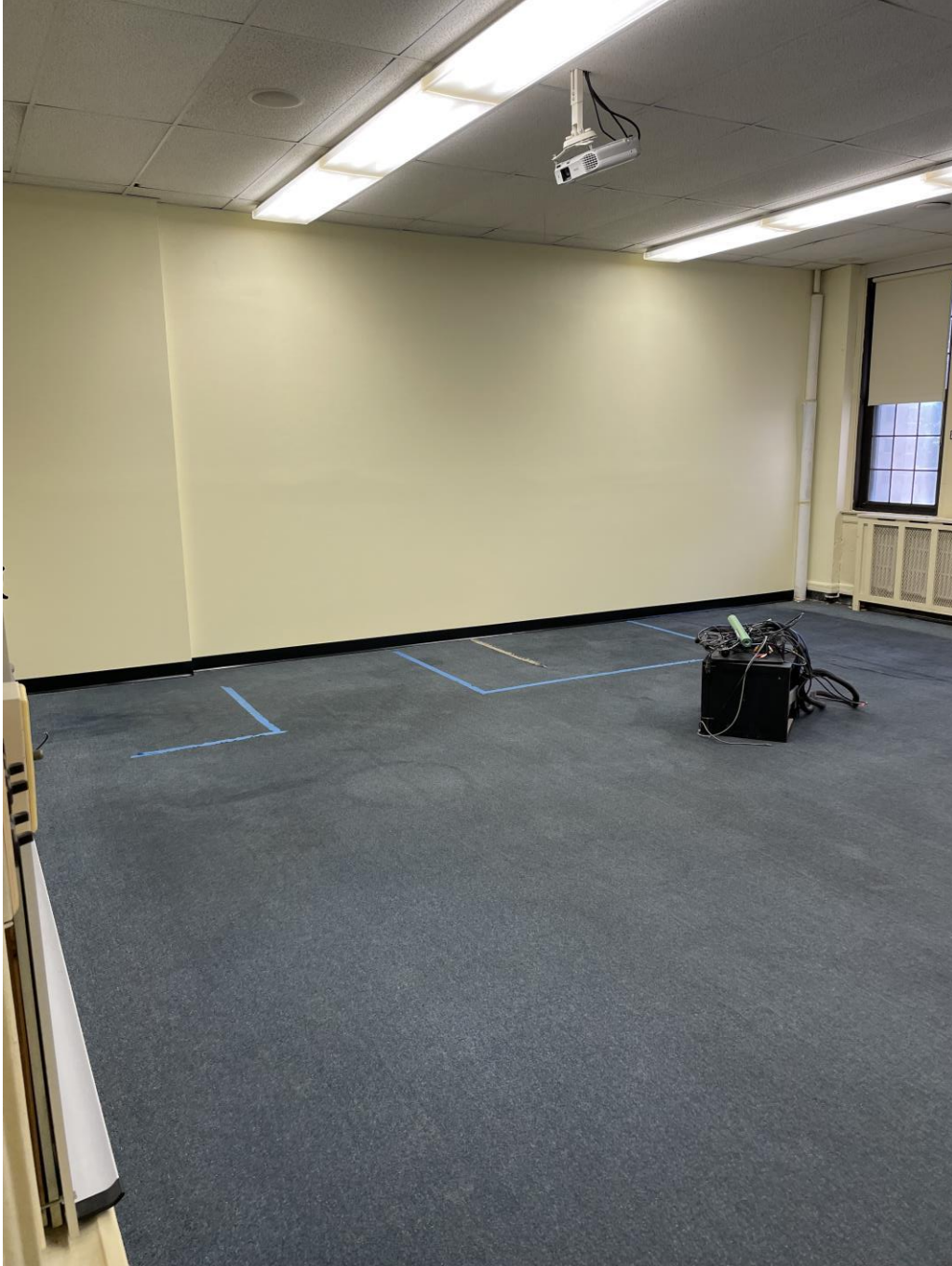
New walls for connecting corridor to addition at SME