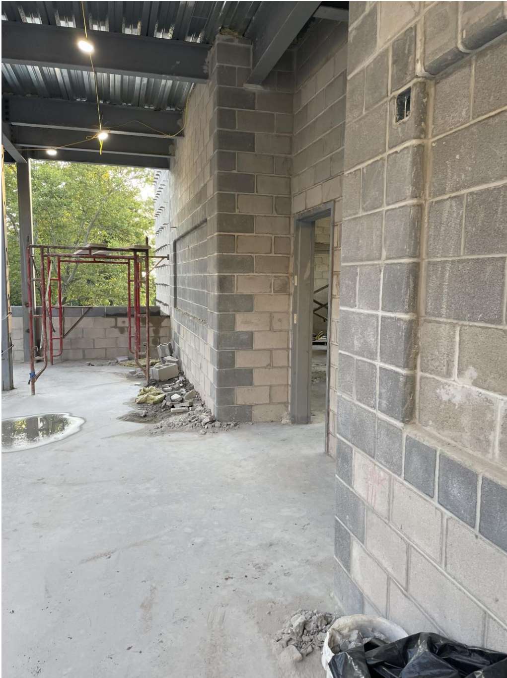
Interior blockwork for addition at SME